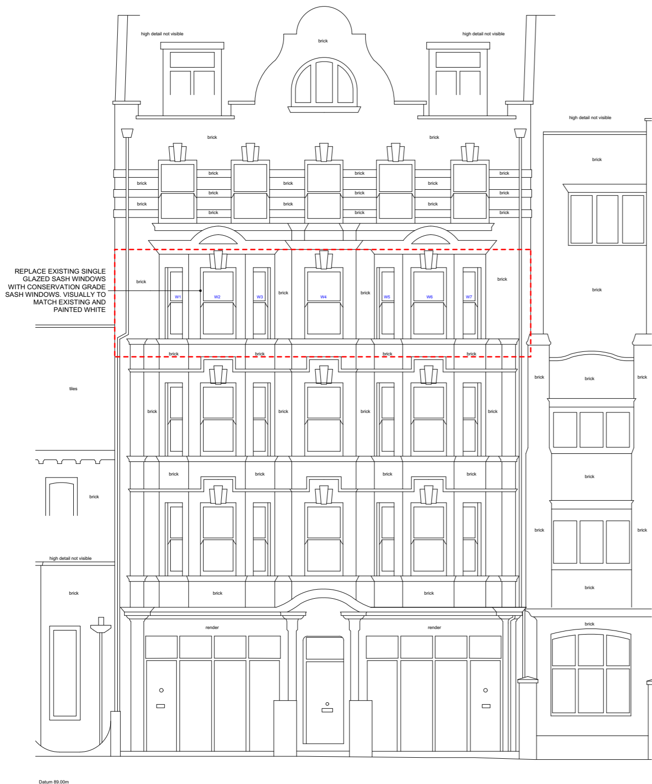
1 EXISTING & PROPOSED ELEVATION (A) REAR Scale 1:100 @ A3