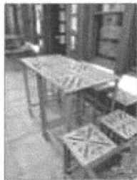
Tables & Chairs