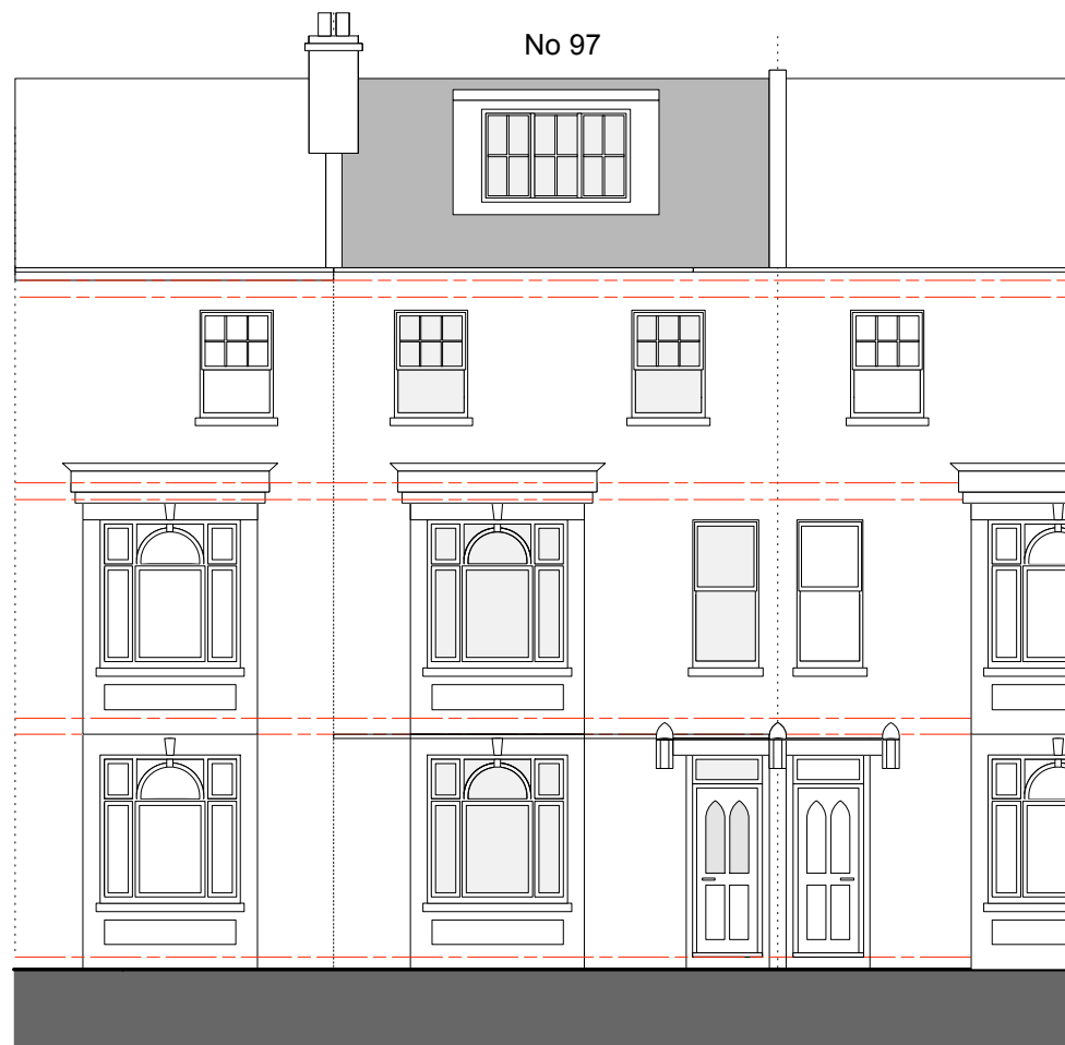
Proposed Front Elevation ( Remains Unchnaged) 1:100