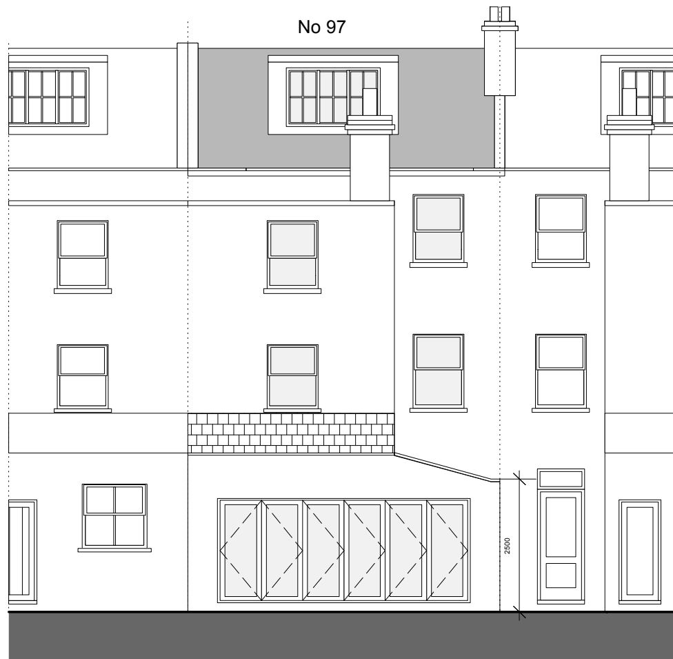
Proposed Rear Elevation 1:100