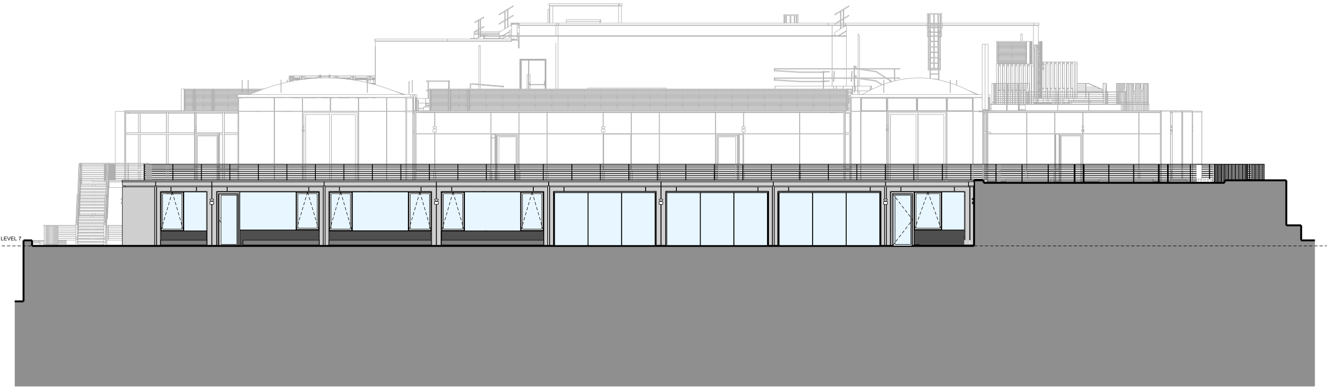
01 EXISTING HOWLANDS STREET ELEVATION LEVEL 07 SCALE 1:100

Notes This drawing is copyright Piercy&Company. Do not scale from this drawing. All dimensions and levels to be checked on site by the contractor and such dimensions to be his responsibility. Report all drawing errors, omissions and discrepancies to the architect. Disclaimer This document may be issued in an editable digital CAD format to enable others to use it as background information to make alterations and/or additions. In that instance the file will be accompanied by a PDF version as a record of the original file. It is for those parties making such alterations and/or additions to ensure that they make use of current background information. Piercy&Company accepts no liability for either: any such alterations and/or additions to the background information by others; or any other changes made by others to the architectural content of the background information itself.