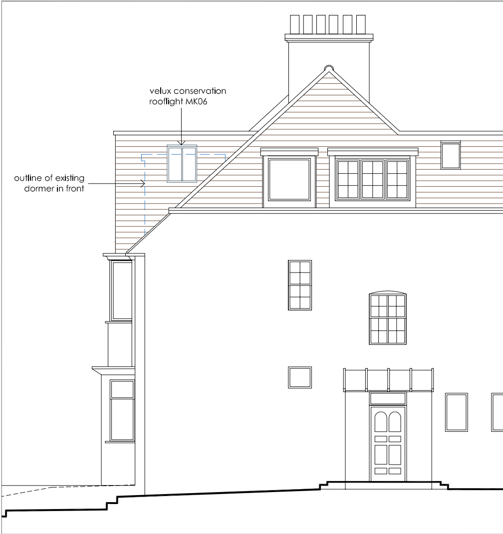
part NE elevation with dormer omitted