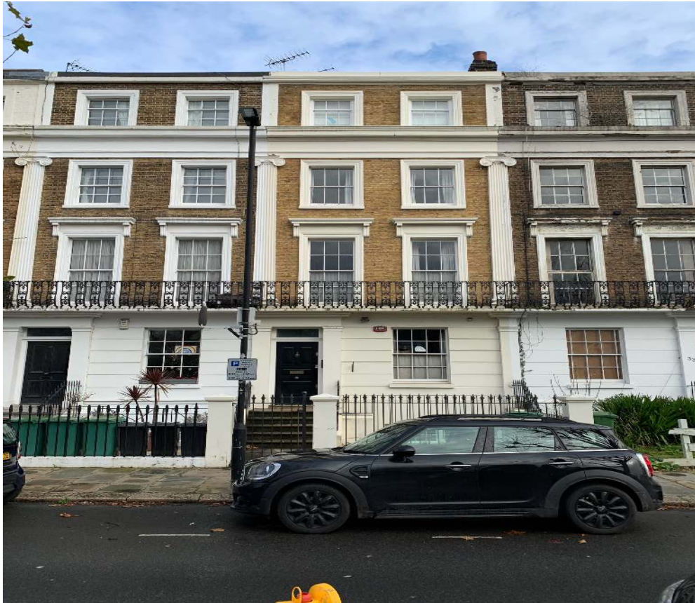
Photo 2 – 34 Mornington Terrace with exposed brickwork to 3 rd floor

It is proposed to remove the paintwork so the front façade resembles its original state, as shown in photo 2 below, which is actually no 34 Mornington Terrace.