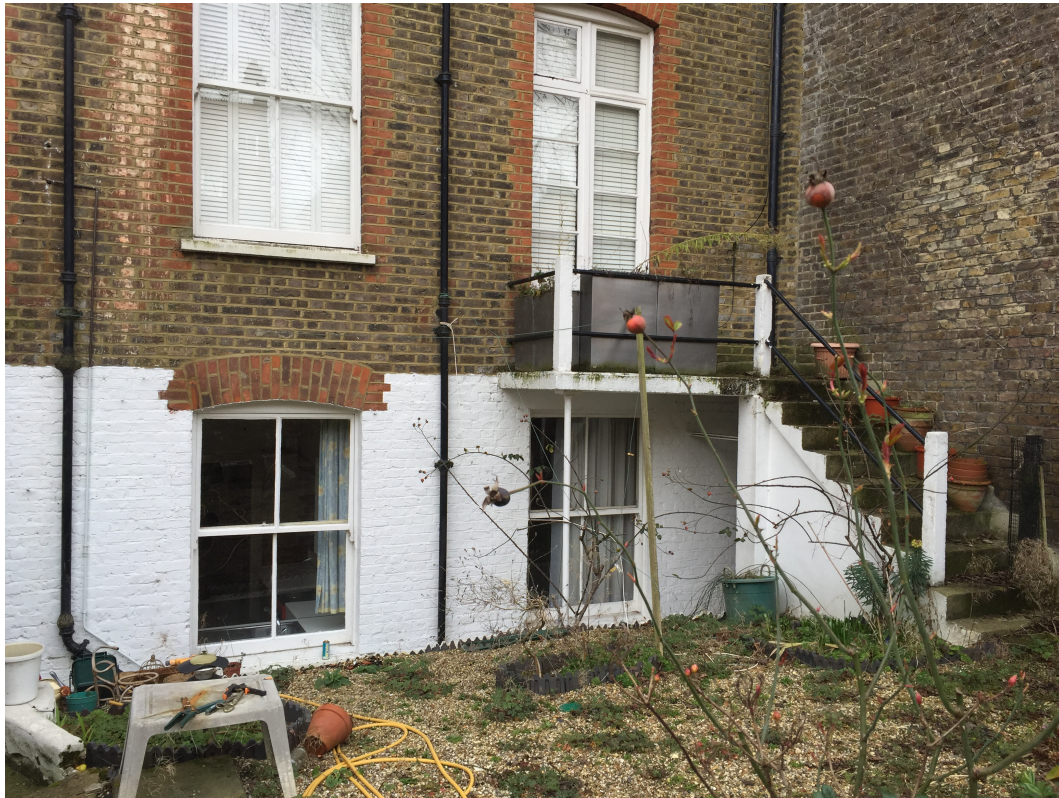
View to the rear of 134