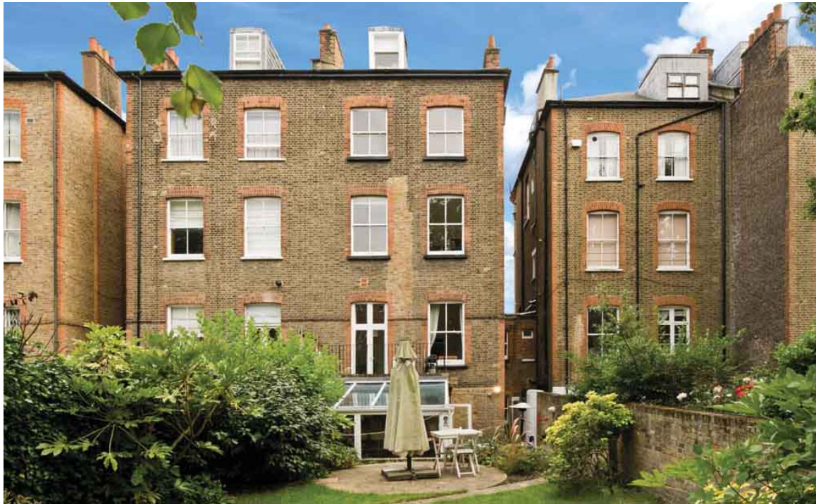
View to the rear of no.132