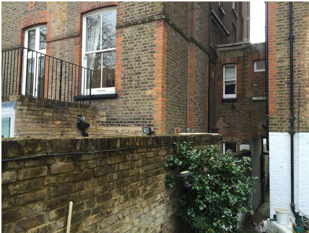
View to the rear of 132 & 134