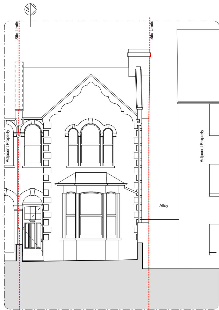
01 Front Elevation - Section FF