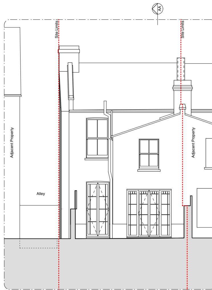
02 Rear Elevation - Section EE