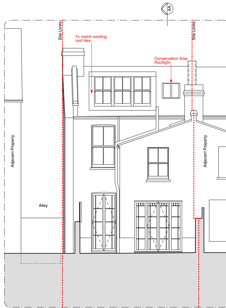
02 Rear Elevation - Section EE