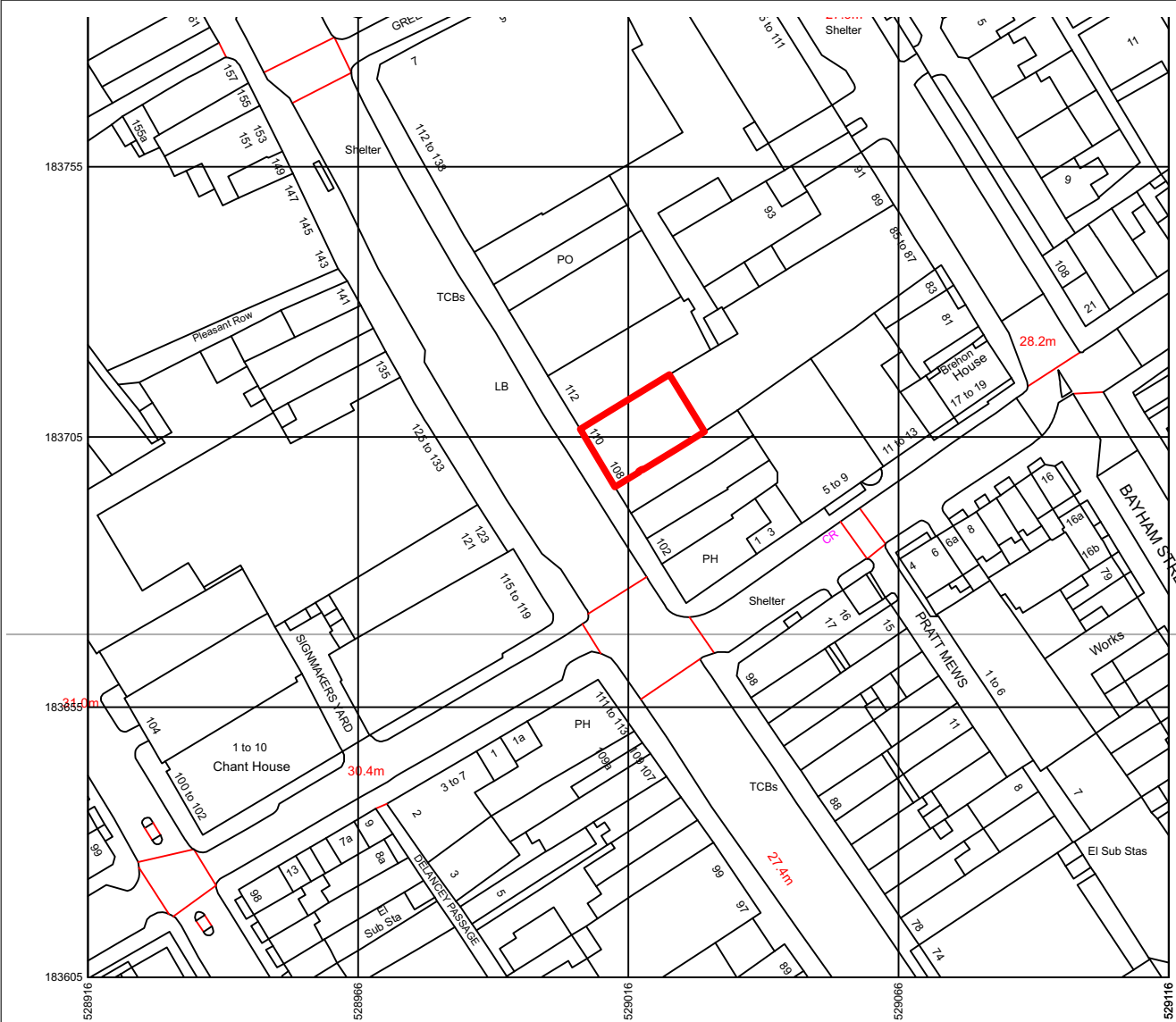
1 Location Plan Scale 1:1250