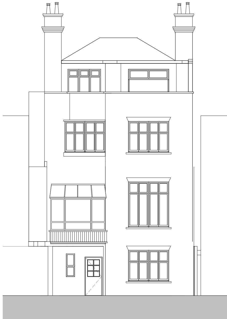
Rear Elevation - Existing 1 : 100