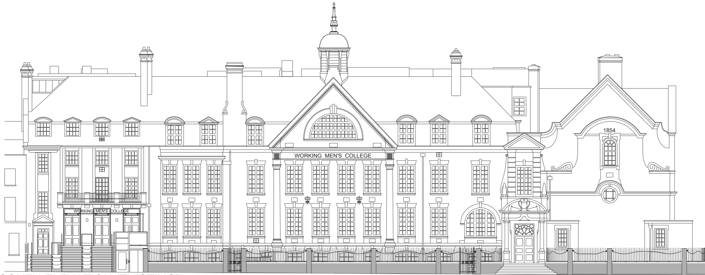
SOUTH ELEVATION (EXISTING)

NOTES Drawings procured from record drawings Dimensions to be checked on site