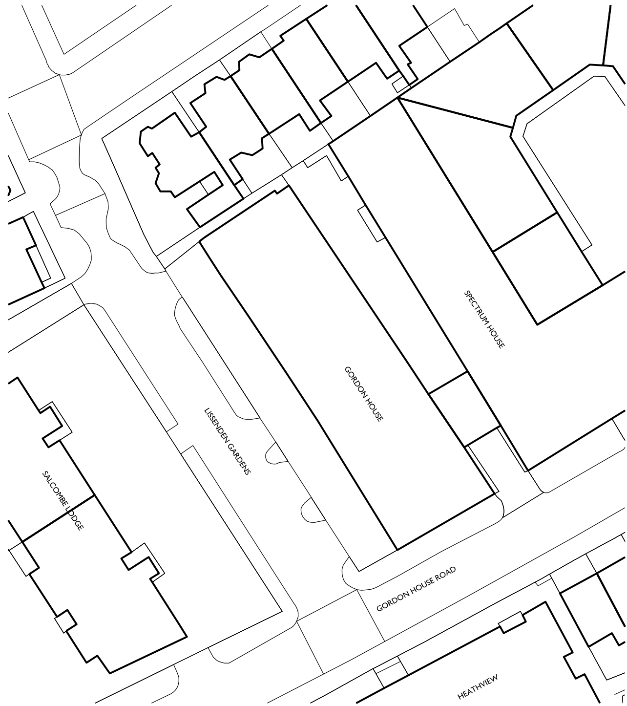
SITE BLOCK PLAN 1:500