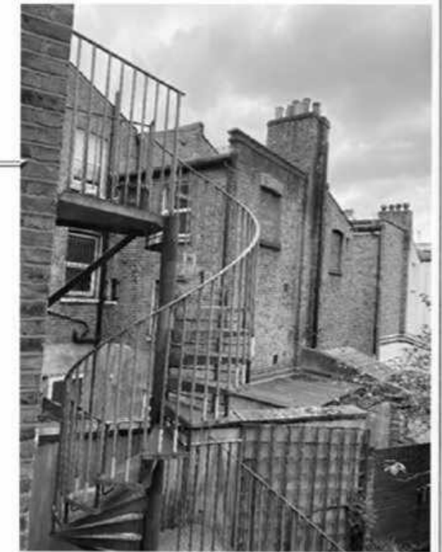
Existing walkways and spiral