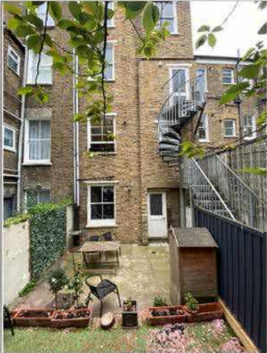
Existing Walkways steps and spiral