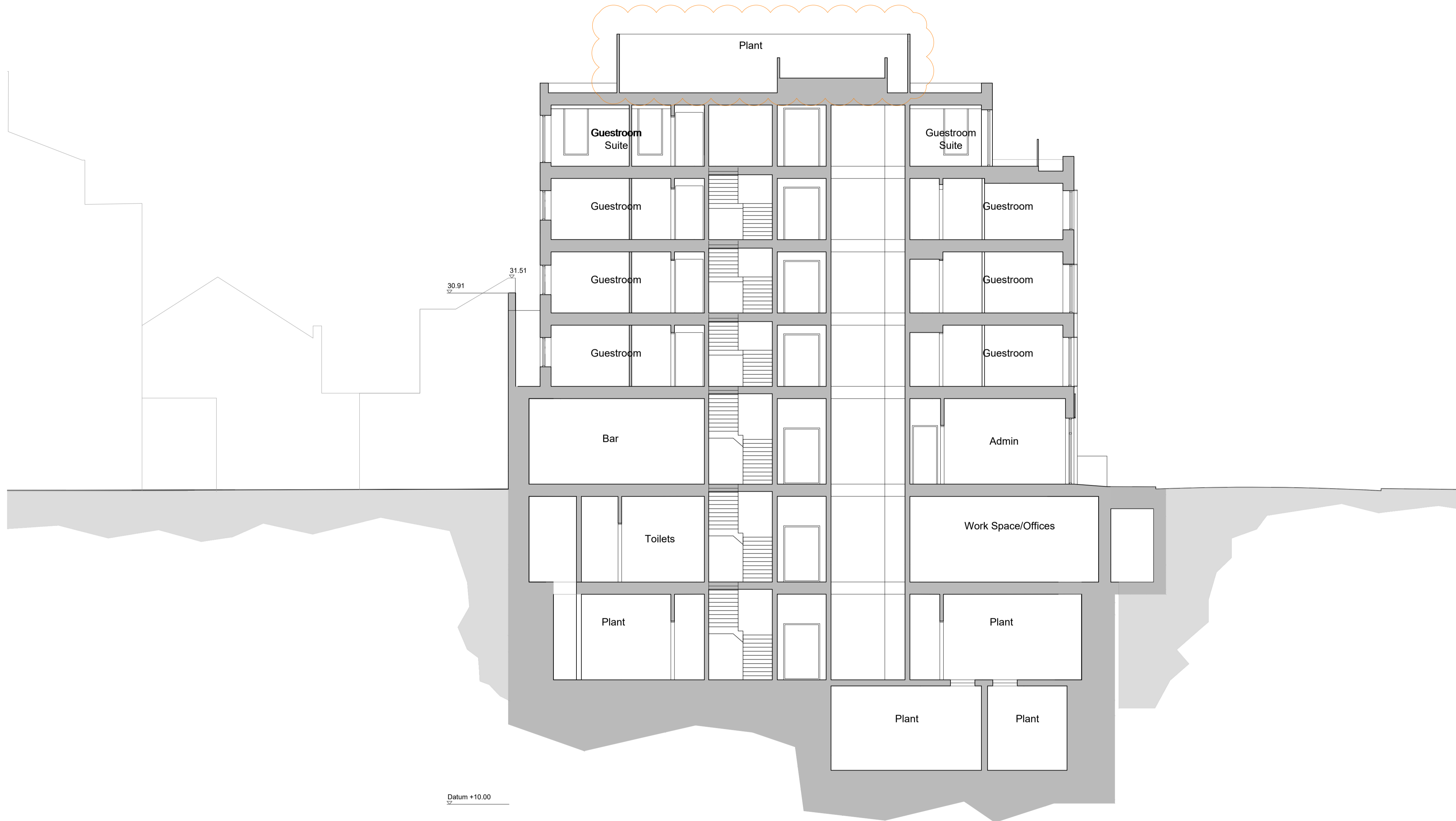
Section BB 1:100