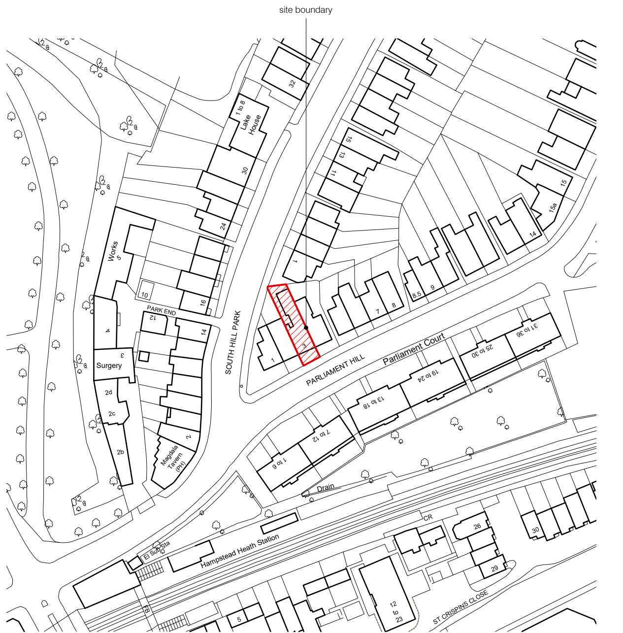
01 LOCATION PLAN scale 1:1250