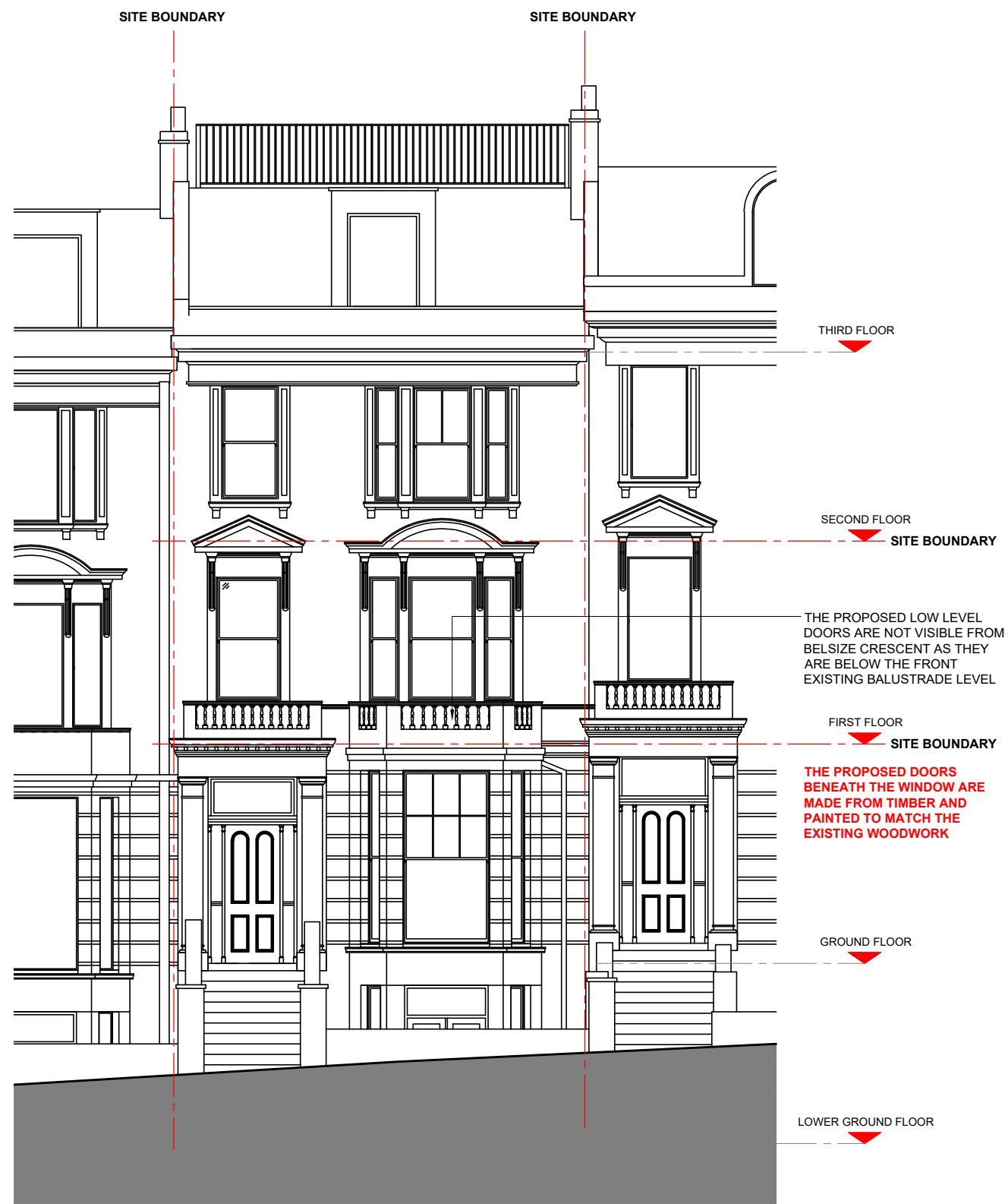
2 EXISTING FRONT ELEVATION_ SCALE 1:100 @ A3