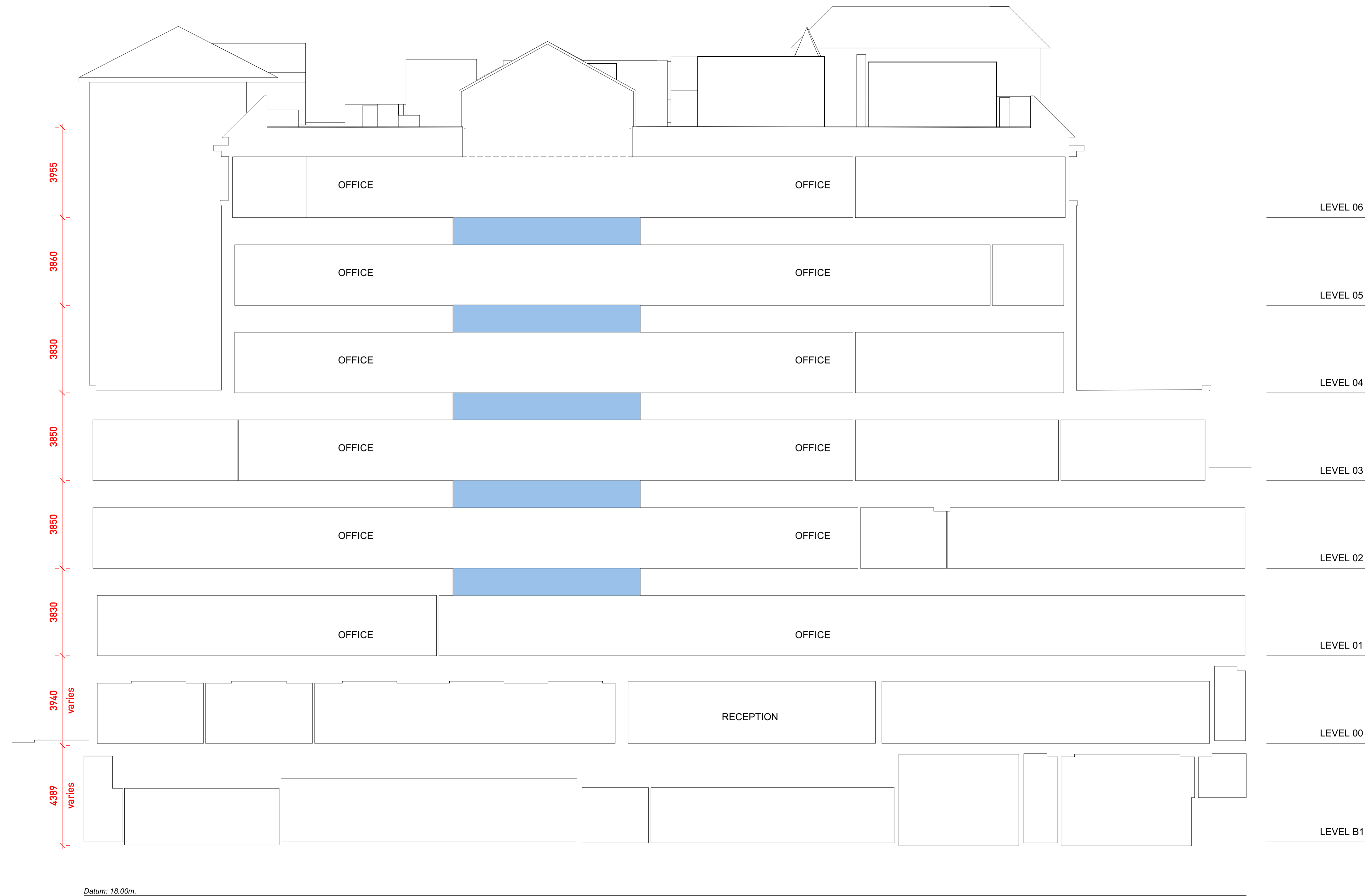
1 BUILDING SECTION BB Scale: 1:100