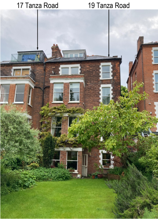
From rear garden of 19 Tanza Road