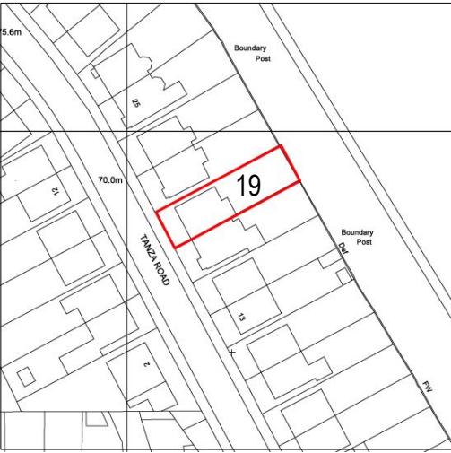
Key plan: 19 Tanza Road