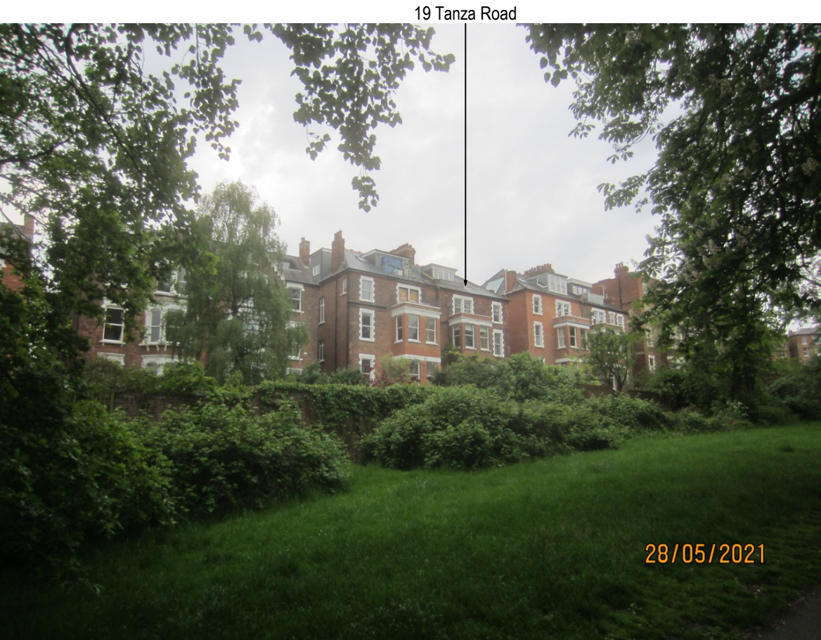
View of the backs of the Tanza Road houses from the footpath in Parliament Hill Fields