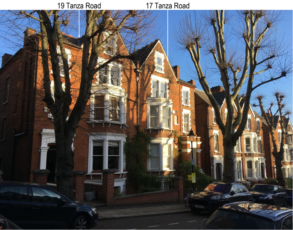
19 Tanza Road and 17 Tanza Road in the street context