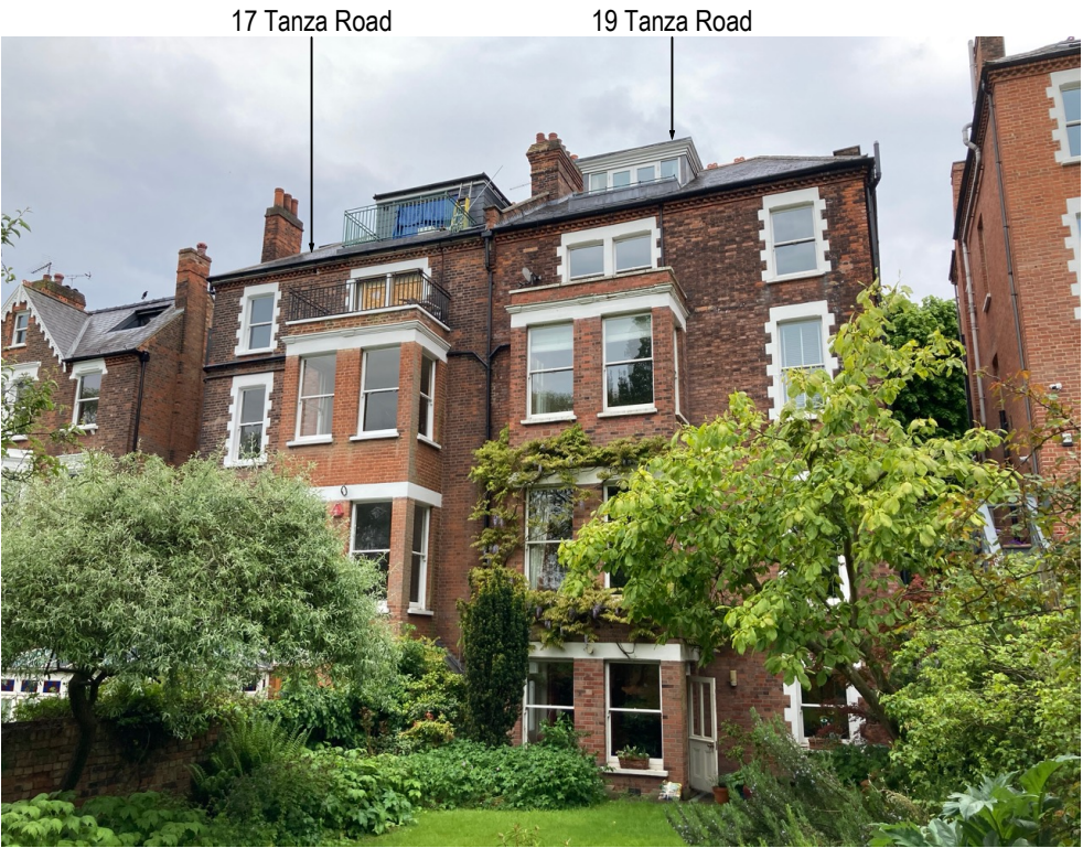
From rear garden of 19 Tanza Road