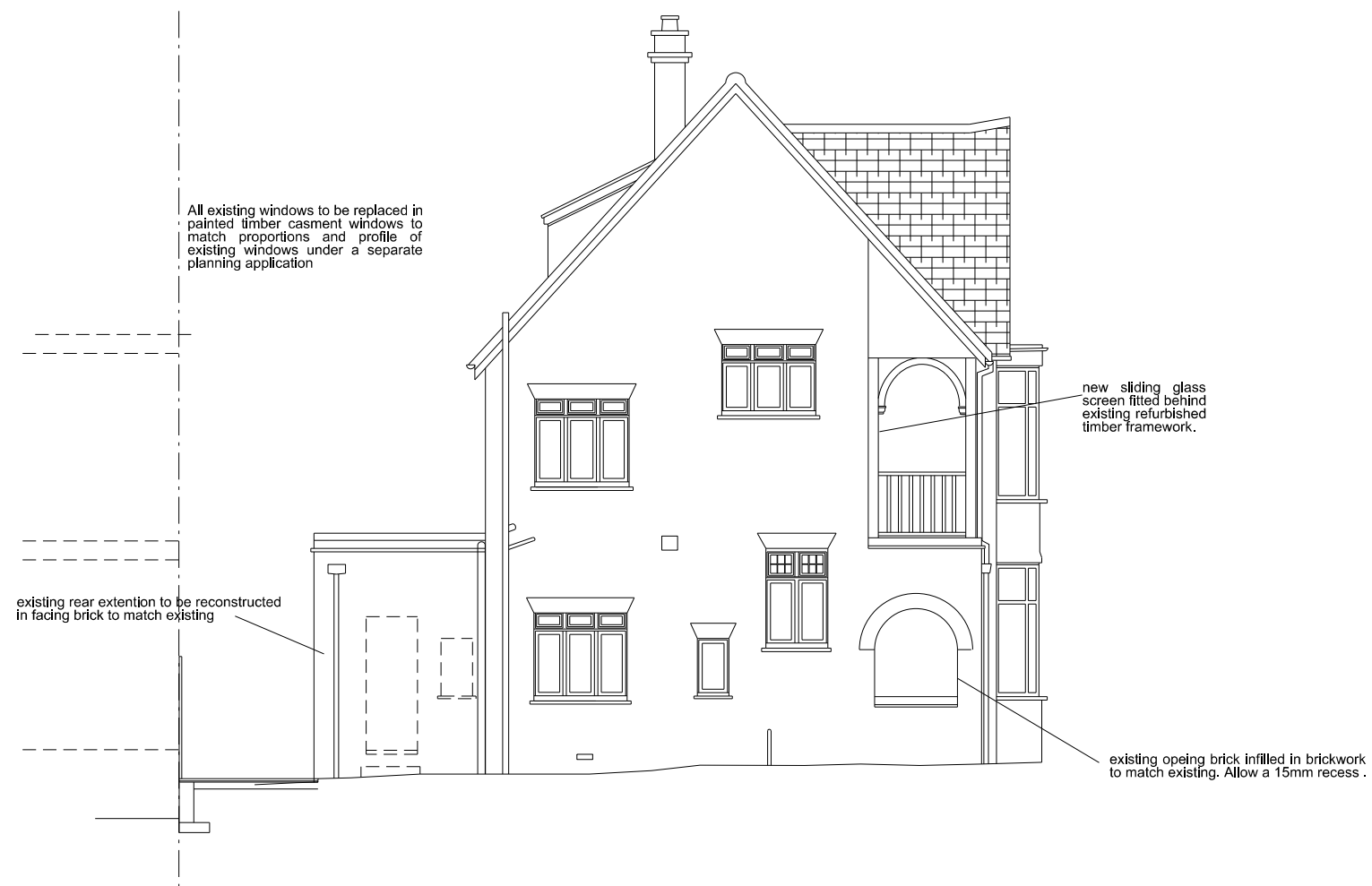
Datum: 78.00m. Elevation 3. Proposed Side Elevation