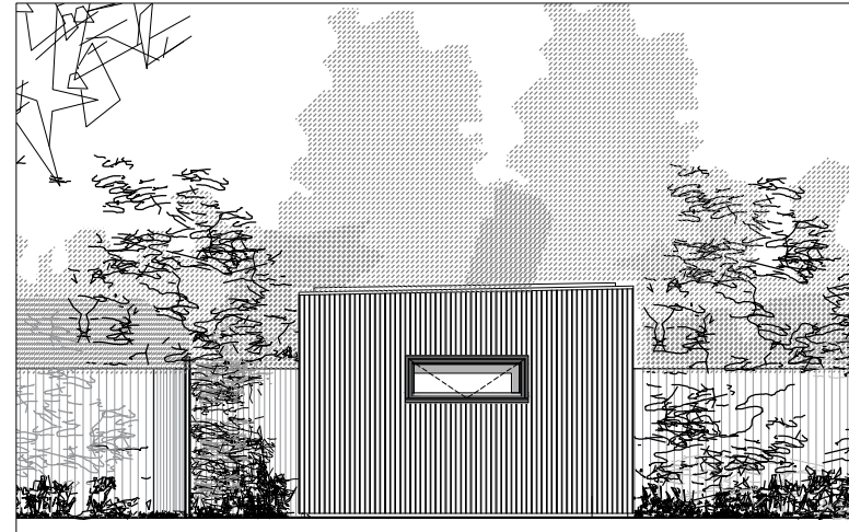
SOUTH EAST ELEVATION SCALE 1:100