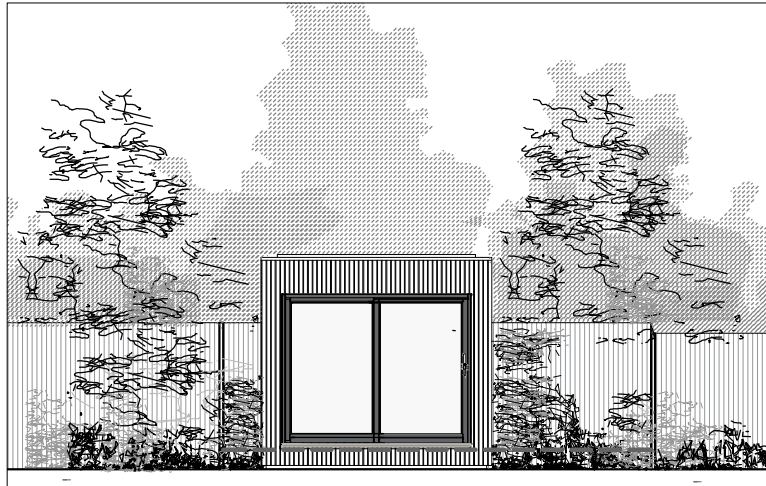
NORTH EAST ELEVATION SCALE 1:100