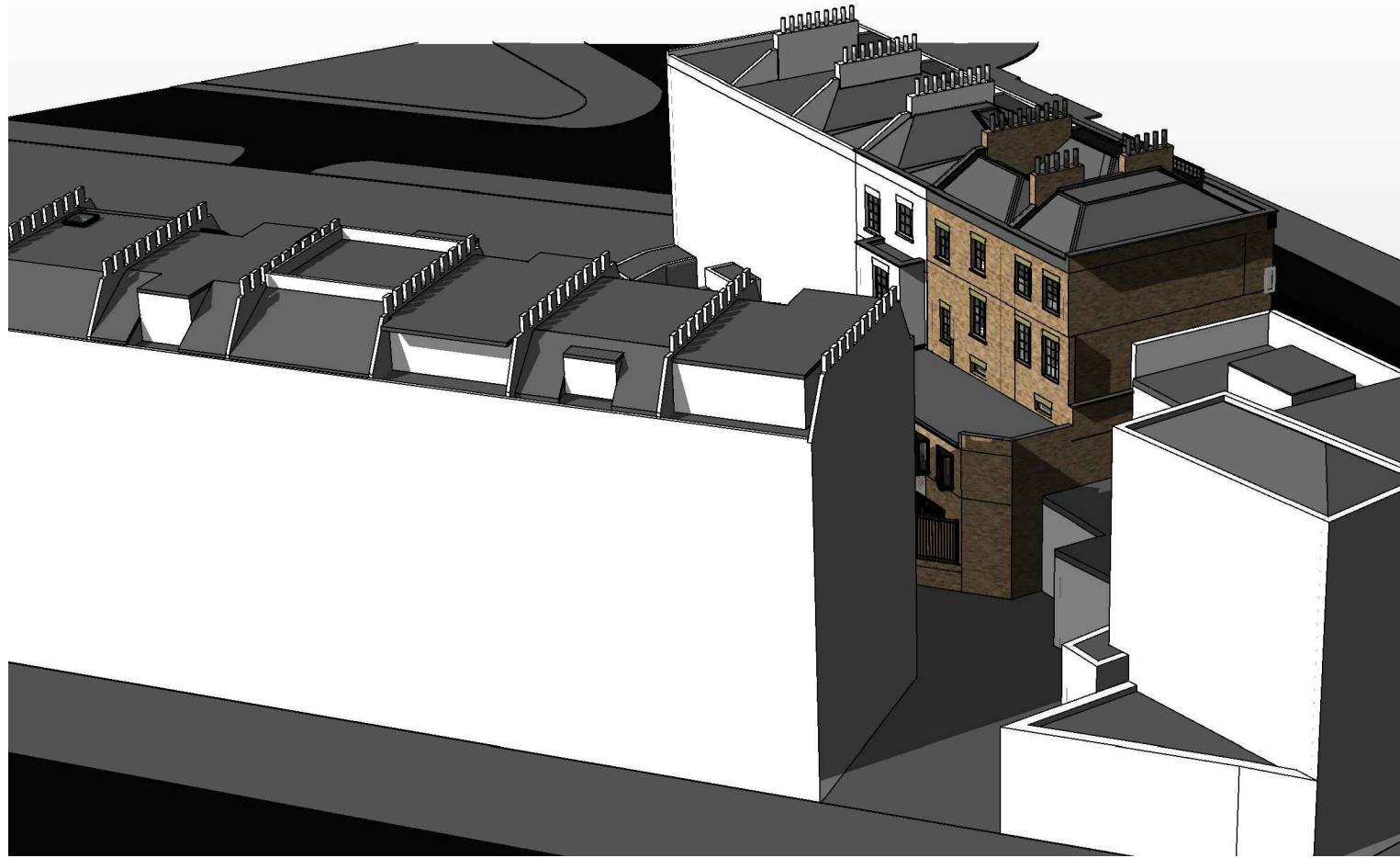
V1 -- Proposed Rear View