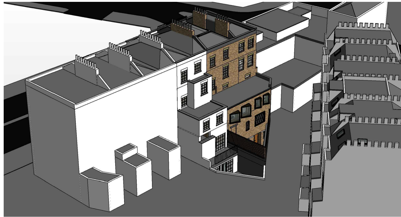
V2 -- Proposed Rear View