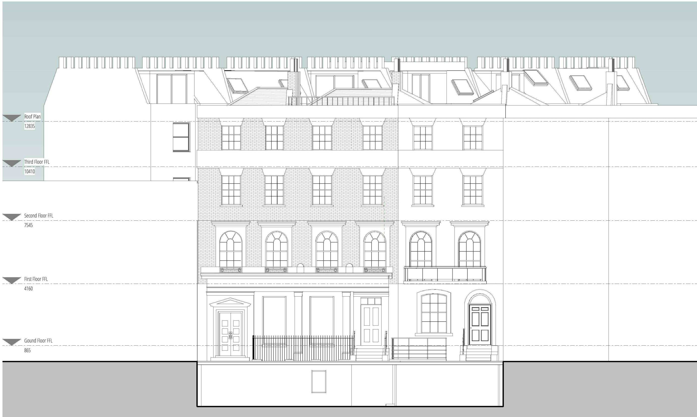
1 Proposed West Front Elevation 1: 100

NOTES: 1. THIS DRAWING IS COPYRIGHTED AND MUST NOT BE REPRODUCED IN WHOLE OR IN PART WITHOUT WRITTEN PERMISSION OF GAA DESIGN. 2. THIS DRAWING REPRESENTS DESIGN INTENT AND CONCEPT ONLY. IT CAN BE SEALED FOR PLANNING PURPOSES ONLY. 3. THIS DOCUMENT AND ALL ASSOCIATED DOCUMENTS ARE PREPARED FOR SPECIFIC SITE AND EVENT, AND INCORPORATE CALCULATIONS AND MEASUREMENTS AVAILABLE FROM THE CLIENT AT THE TIME OF DRAFTING. 4. THE RECIPIENT AGREES TO PROTECT THE CONTENTS FROM DISTRIBUTION AND DISSEMINATION EXCEPT AS REQUIRED FOR THE SPECIFIC EVENT NAMED, WITHOUT THE WRITTEN PERMISSION OF THE DESIGNER. 5. USE OF THIS DESIGN IS GRANTED TO THE CLIENT FOR THE SPECIFIC AND NAMED EVENT ONLY. COPYRIGHT © 2019