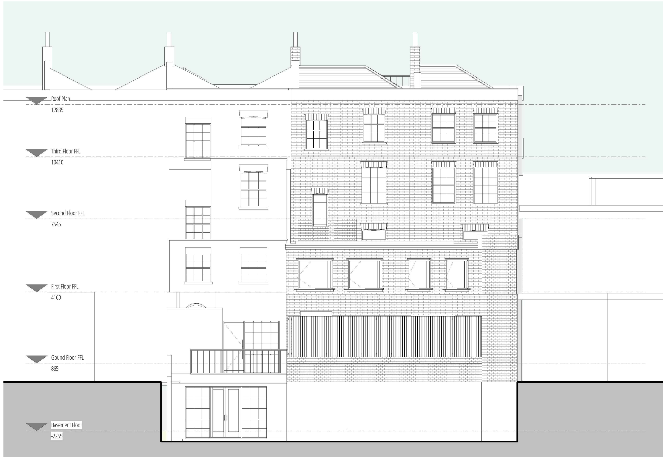
1 Proposed East Rear Elevation 1: 100

NOTES: 1. THIS DRAWING IS COPYRIGHT AND MUST NOT BE REPRODUCED IN WHOLE OR IN PART WITHOUT WRITTEN PERMISSION OF GAA DESIGN. 2. THIS DRAWING REPRESENTS DESIGN INTENT AND CONCEPT ONLY. IT CAN BE SCALED FOR PLANNING PURPOSES ONLY. 3. THIS DOCUMENT AND ALL ASSOCIATED DOCUMENTS ARE PREPARED FOR SPECIFIC SITE AND EVENT, AND INCORPORATE CALCULATIONS AND MEASUREMENTS AVAILABLE FROM THE CLIENT AT THE TIME OF DRAFTING. 4. THE RECIPIENT AGREES TO PROTECT THE CONTENTS FROM DISTRIBUTION AND DISSEMINATION EXCEPT AS REQUIRED FOR THE SPECIFIC EVENT NAMED, WITHOUT THE WRITTEN PERMISSION OF THE DESIGNER. 5. USE OF THIS DESIGN IS GRANTED TO THE CLIENT FOR THE SPECIFIC AND NAMED EVENT ONLY. COPYRIGHT © 2019