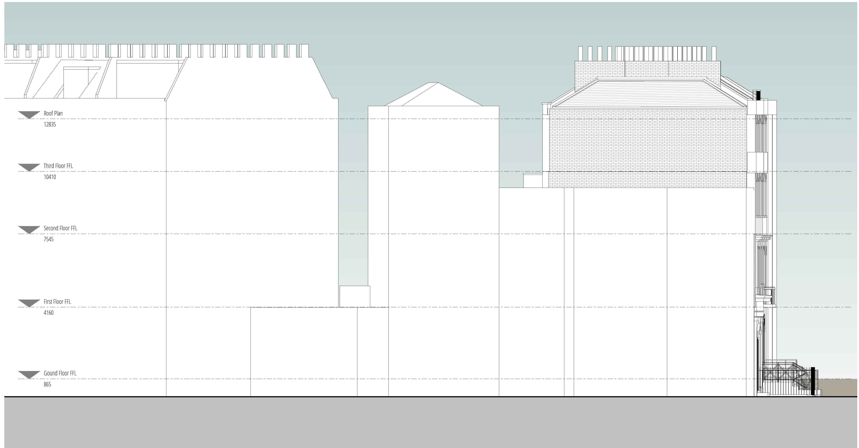
1 Proposed North Side Elevation 1:100

NOTES: 1. THIS DRAWING IS COPYRIGHT AND MUST NOT BE RE-PRODUCED IN WHOLE OR IN PART WITHOUT WRITTEN PERMISSION OF GAA DESIGN. 2. THIS DRAWING REPRESENTS DESIGN INTENT AND CONCEPT ONLY. HENCE IT CAN BE SCALED FOR PLANNING PURPOSES ONLY. 3. THIS DOCUMENT AND ALL ASSOCIATED DOCUMENTS ARE PREPARED FOR SPECIFIC SITE AND EVENT, AND INCORPORATE CALCULATIONS AND MEASUREMENTS AVAILABLE FROM THE CLIENT AT THE TIME OF DRAFTING. 4. THE RECIPIENT AGREES TO PROTECT THE CONTENTS FROM DISTRIBUTION AND DISSEMINATION EXCEPT AS REQUIRED FOR THE SPECIFIC EVENT NAMED, WITHOUT THE WRITTEN PERMISSION OF THE DESIGNER. 5. USE OF THIS DESIGN IS GRANTED TO THE CLIENT FOR THE SPECIFIC AND NAMED EVENT ONLY. COPYRIGHT © 2019