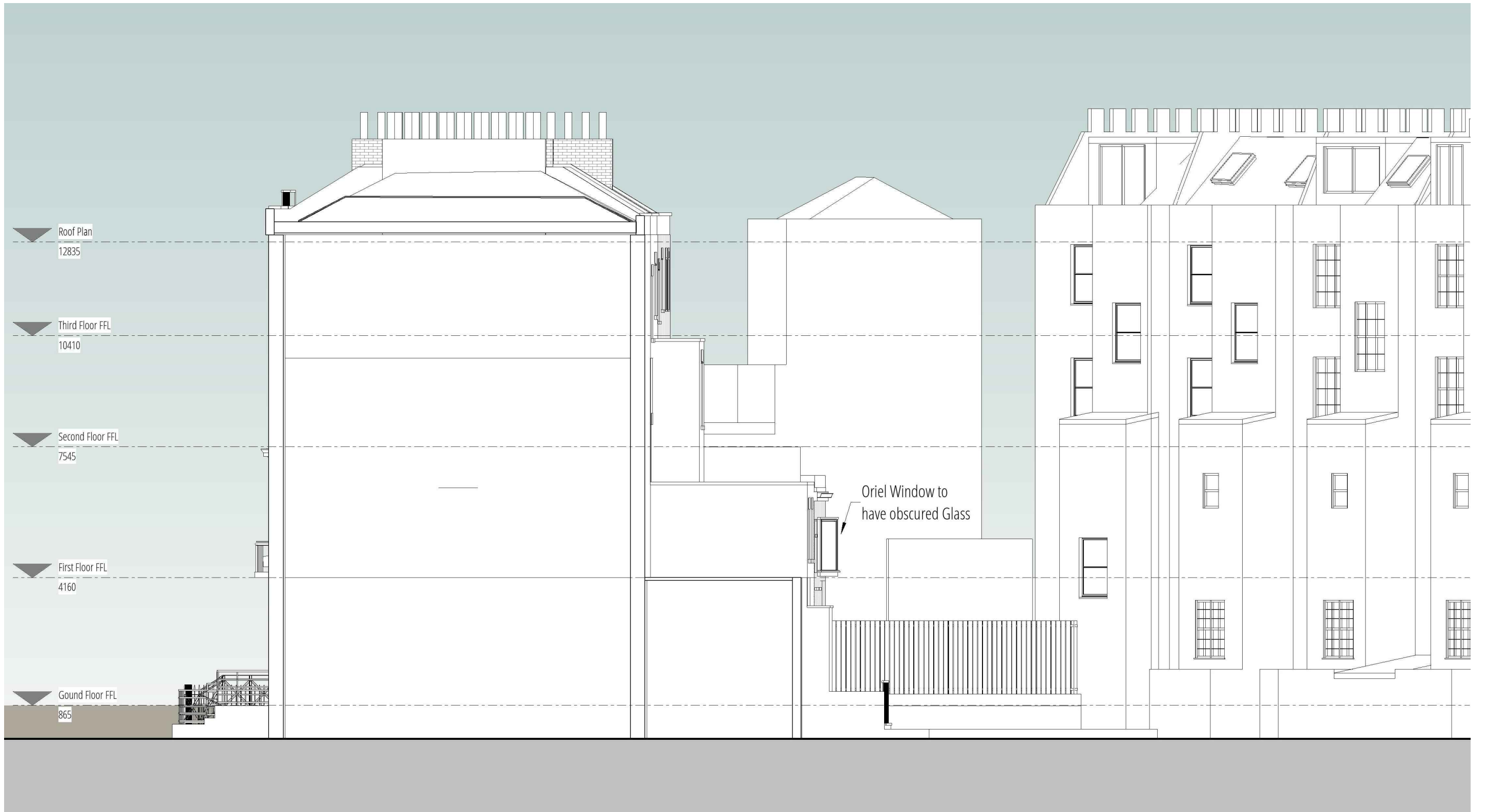
1 East Elevation 1: 100

NOTES: 1. THIS DRAWING IS COPYRIGHT AND MUST NOT BE RE-PRODUCED IN WHOLE OR IN PART WITHOUT WRITTEN PERMISSION OF GAA DESIGN. 2. THIS DRAWING REPRESENTS DESIGN INTENT AND CONCEPT ONLY. HENCE IT CAN BE SCALED FOR PLANNING PURPOSES ONLY. 3. THIS DOCUMENT AND ALL ASSOCIATED DOCUMENTS ARE PREPARED FOR SPECIFIC SITE AND EVENT, AND INCORPORATE CALCULATIONS AND MEASUREMENTS AVAILABLE FROM THE CLIENT AT THE TIME OF DRAFTING. 4. THE RECIPIENT AGREES TO PROTECT THE CONTENTS FROM DISTRIBUTION AND DISSEMINATION EXCEPT AS REQUIRED FOR THE SPECIFIC EVENT NAMED, WITHOUT THE WRITTEN PERMISSION OF THE DESIGNER. 5. USE OF THIS DESIGN IS GRANTED TO THE CLIENT FOR THE SPECIFIC AND NAMED EVENT ONLY. COPYRIGHT © 2019