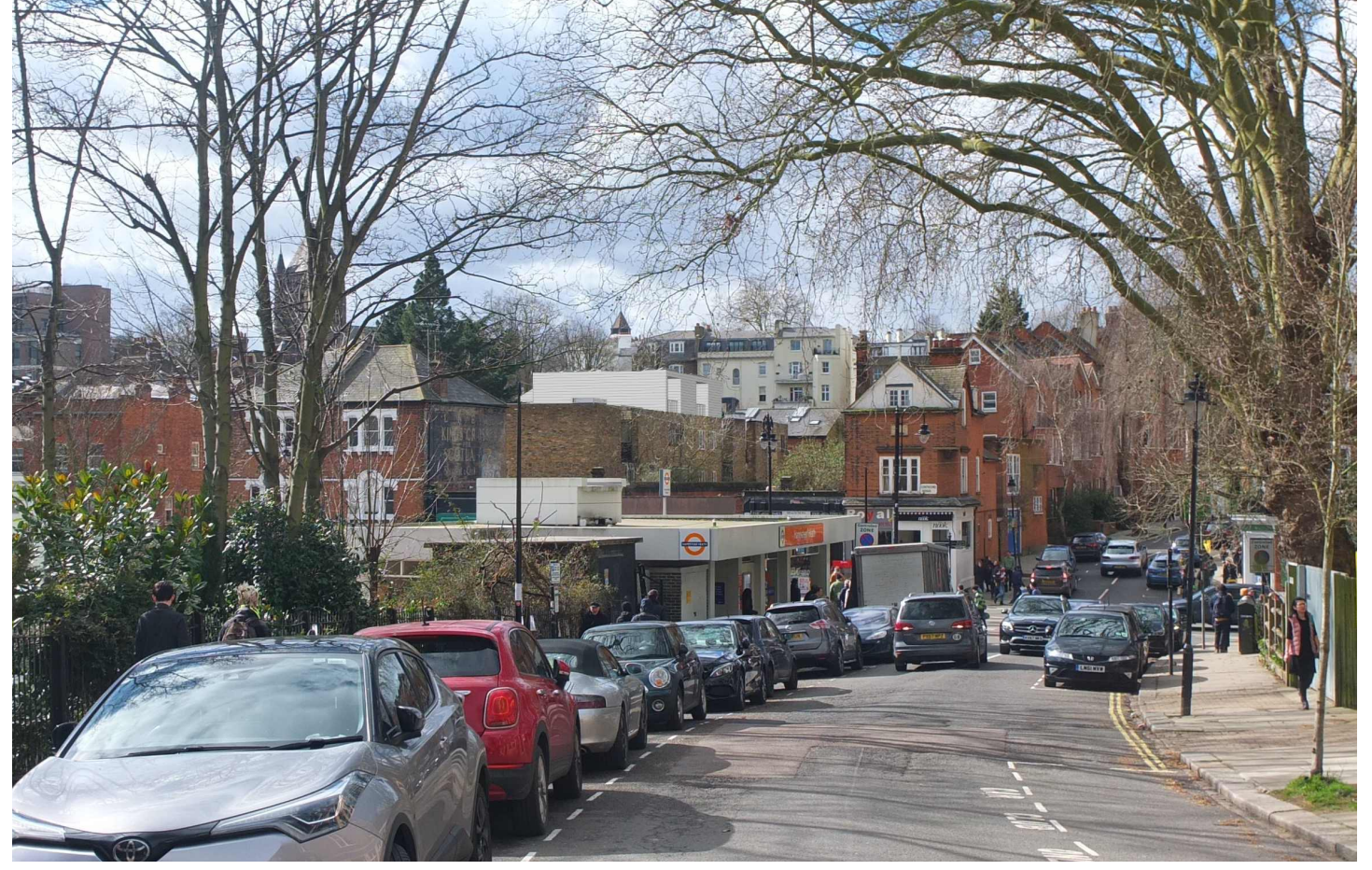
Visualisation of proposed roof extension seen from South Hill Park