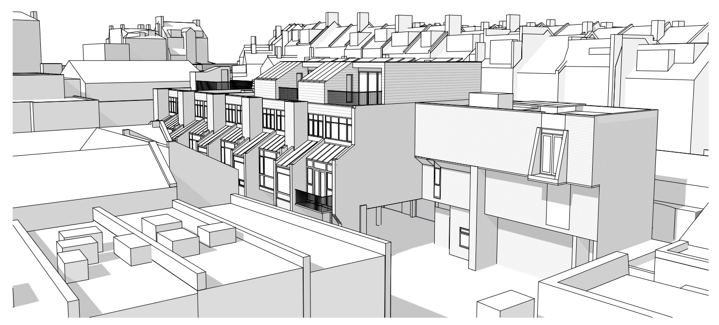
Perspective view in context, from East

As we have demonstrated, these proposals could potentially be carried out across all five houses, which would enhance the existing terrace and visually bring the existing houses back together as a coherent whole, providing an attractive addition to the local townscape.