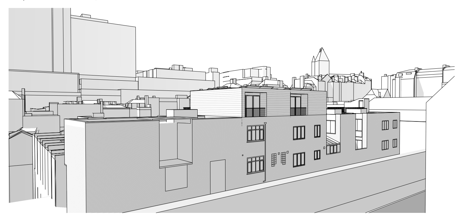
Perspective view in context, from North East