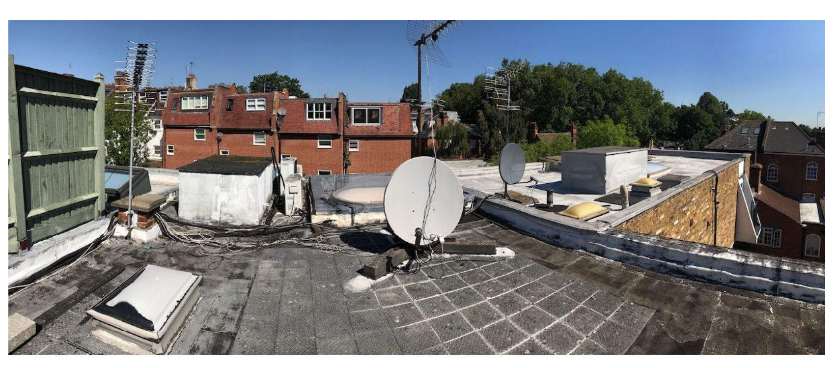
Roof of 23 Maryon Mews