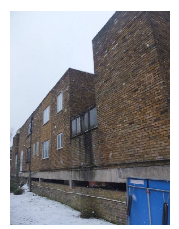
View north west