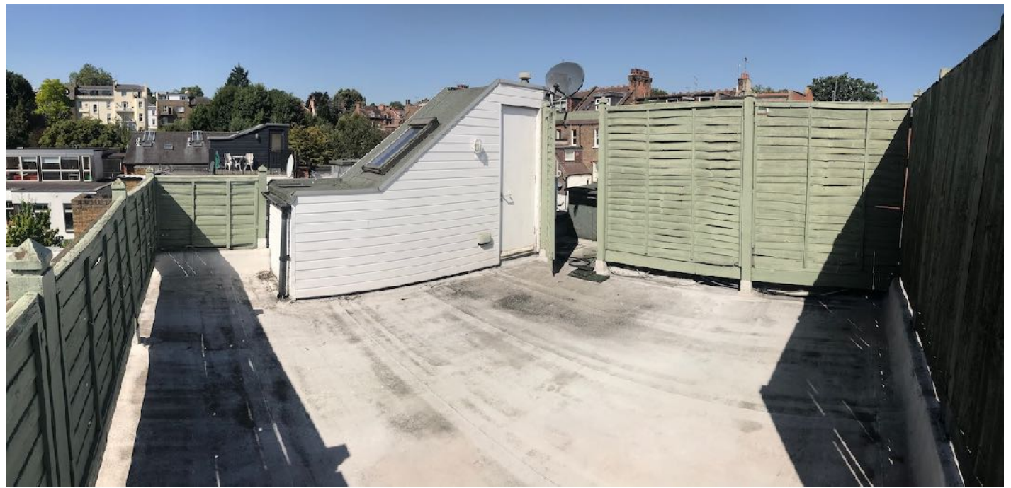
Roof terrace to 22 Maryon Mews