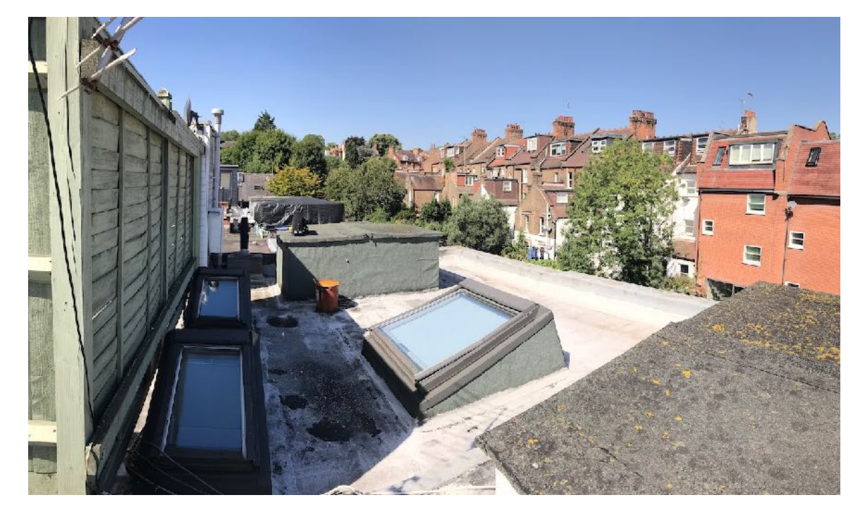
North side of Roof of 22 Maryon Mews