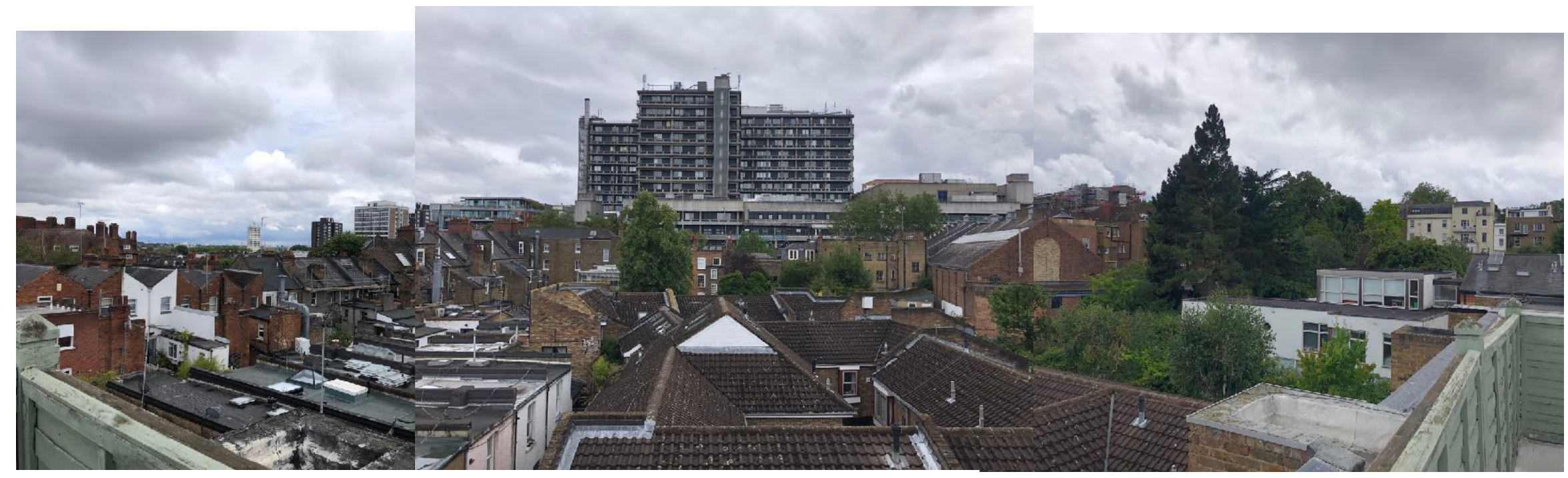
Existing view south from 22 Maryon Mews