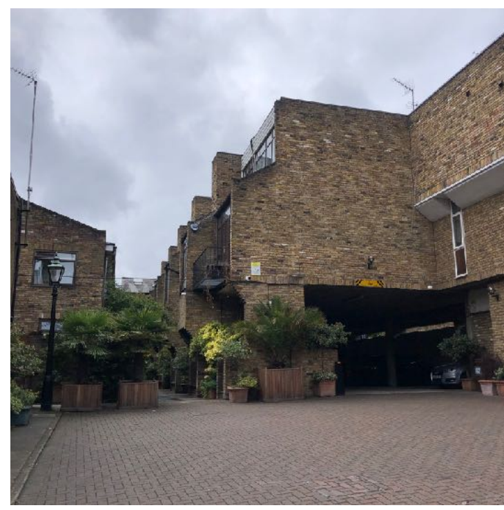
View towards nos. 19-24 from entrance courtyard