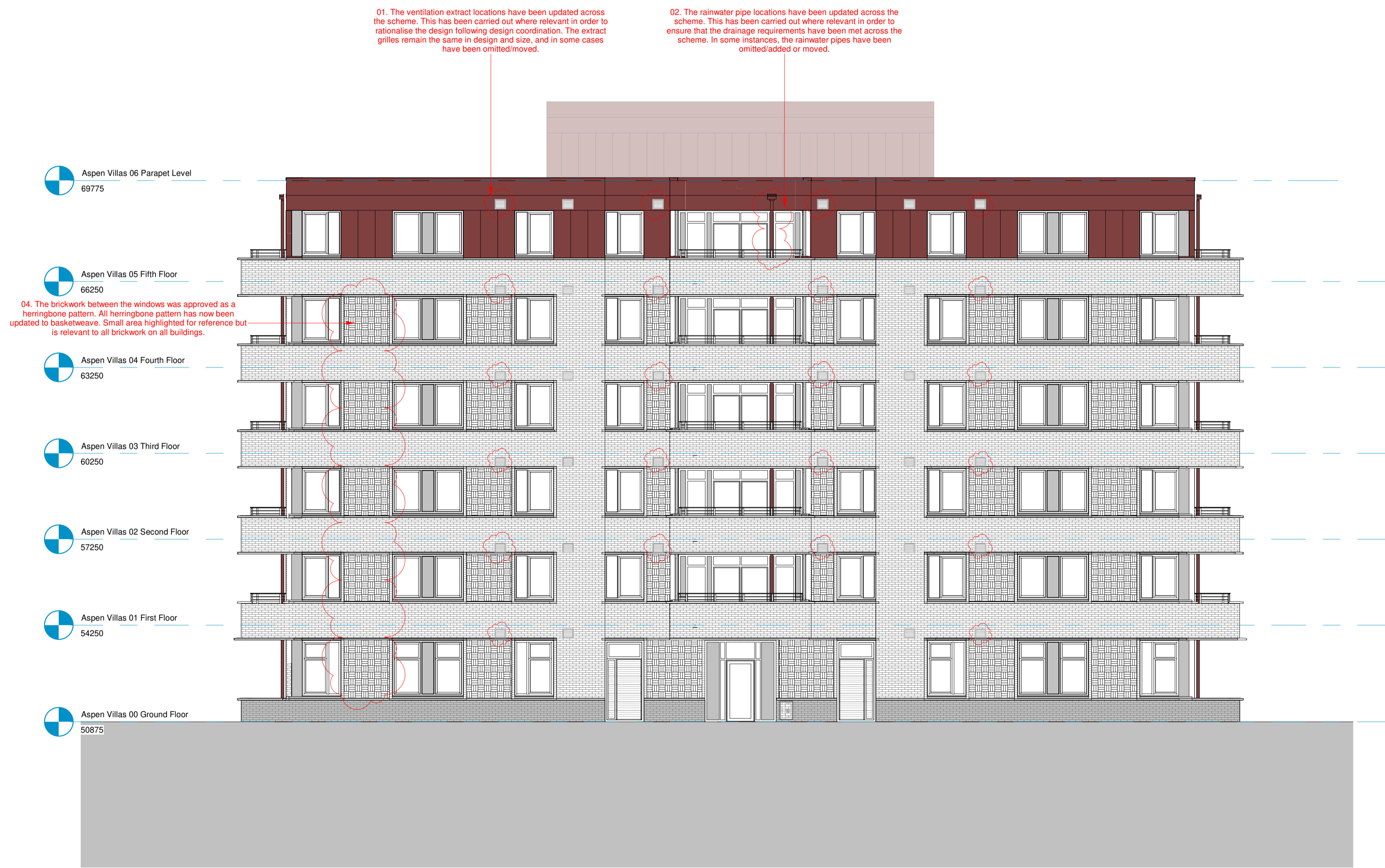
1 East Elevation - Tracked 1 : 100