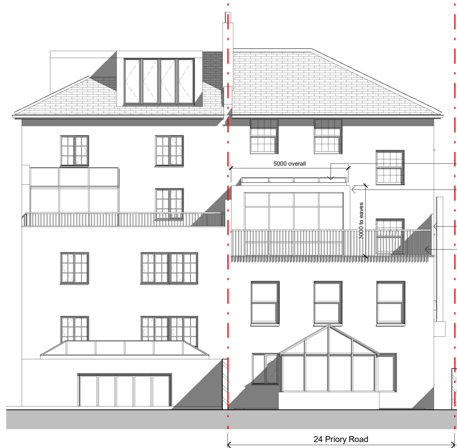
2 | Rear Elevation as Proposed 1 : 100