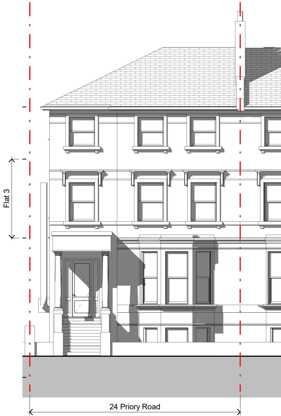
1 | Front Elevation as Proposed 1 : 100