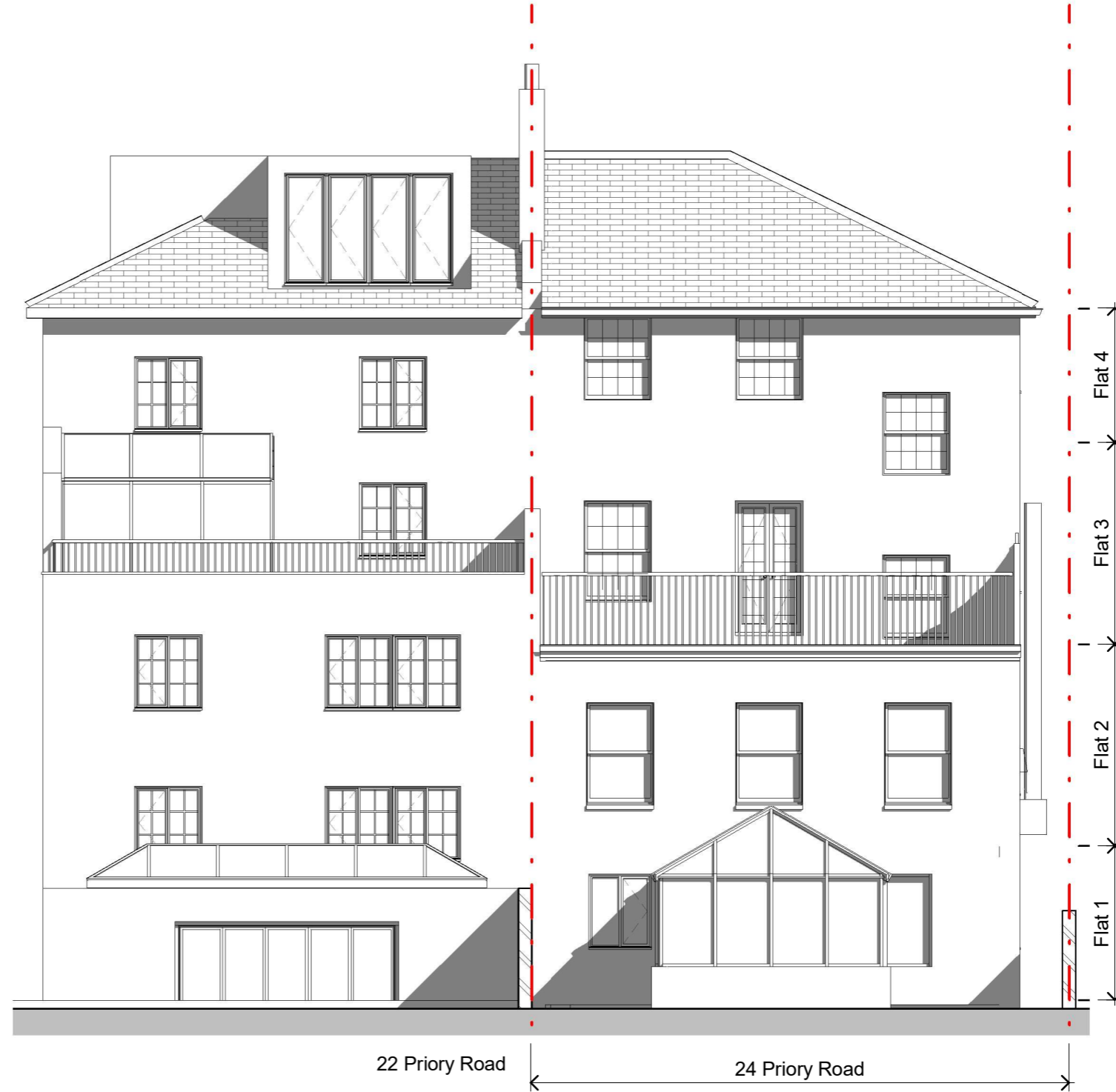
1 | Front Elevation as Existing 1 : 100