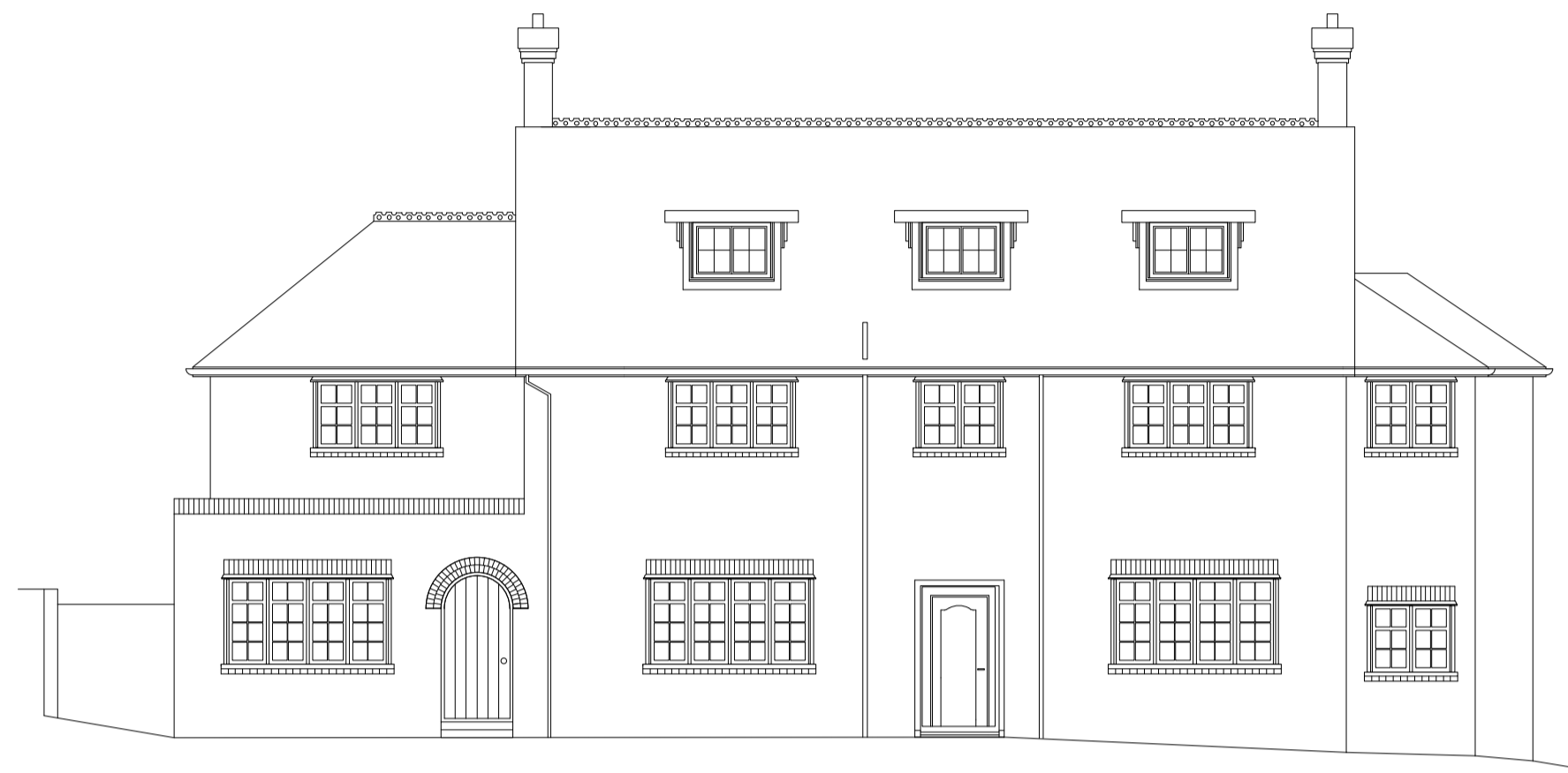
2 Approved Front Elevation Scale: 1:100

Approved Ref: 2019/4220/P (approval for full demolition and replacement)