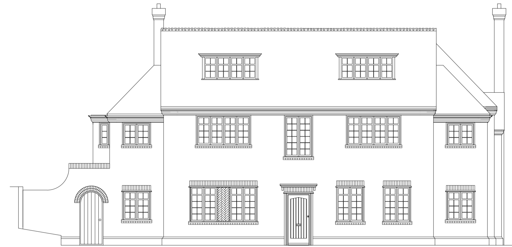
3 Proposed Front Elevation Scale: 1:100

Approved Ref: 2019/4220/P (approval for full demolition and replacement)