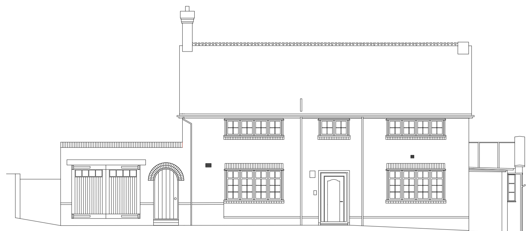
1 Existing Front Elevation Scale: 1:100