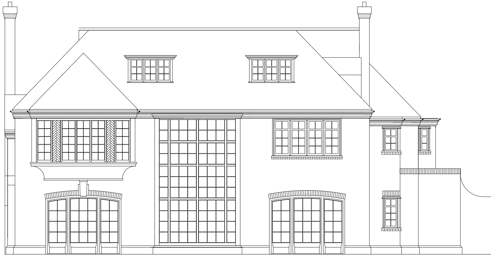
3 Proposed Rear Elevation Scale: 1:100

Approved Ref: 2019/4220/P (approval for full demolition and replacement)