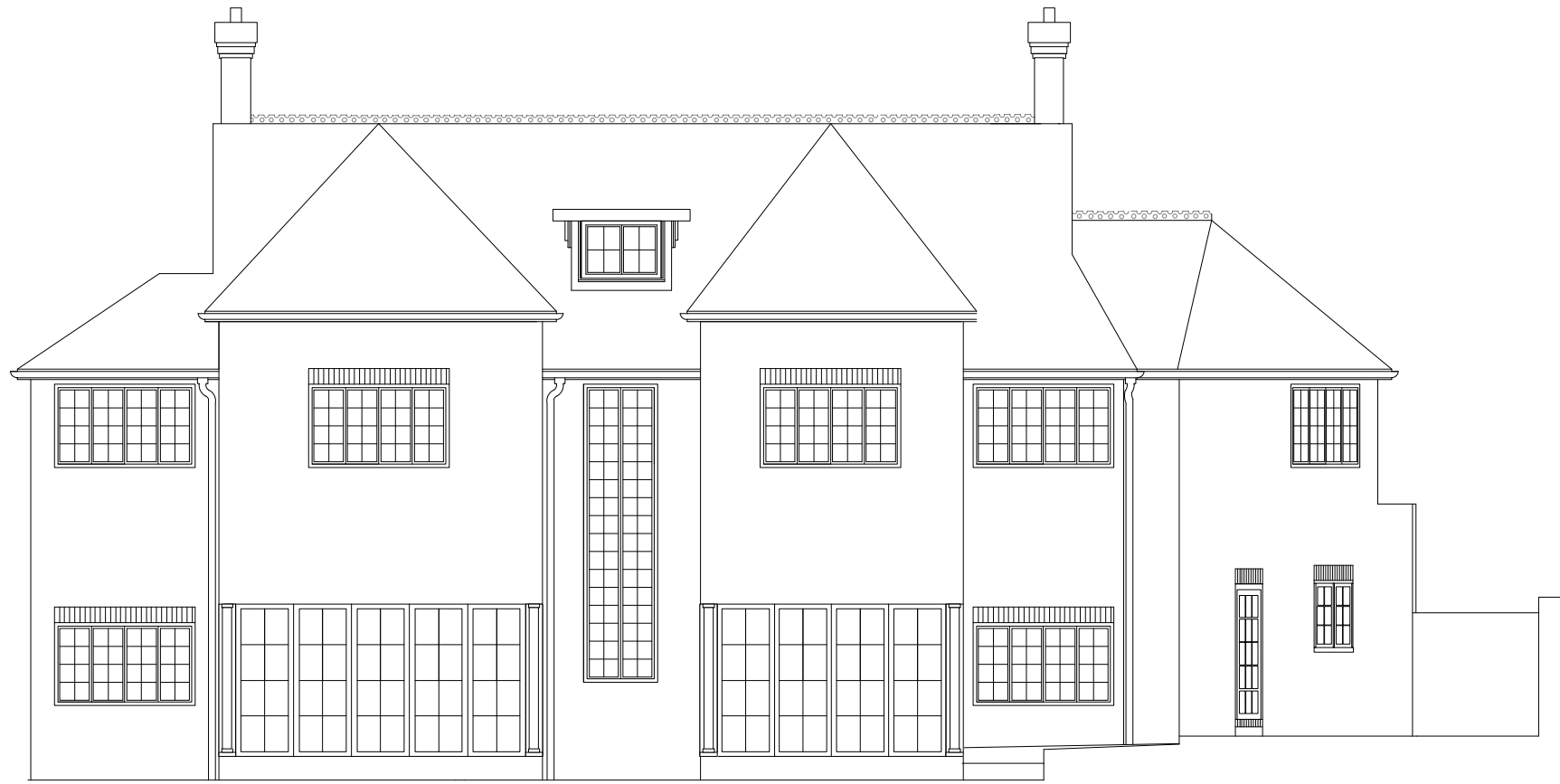
2 Approved Rear Elevation Scale: 1:100

Approved Ref: 2019/4220/P (approval for full demolition and replacement)