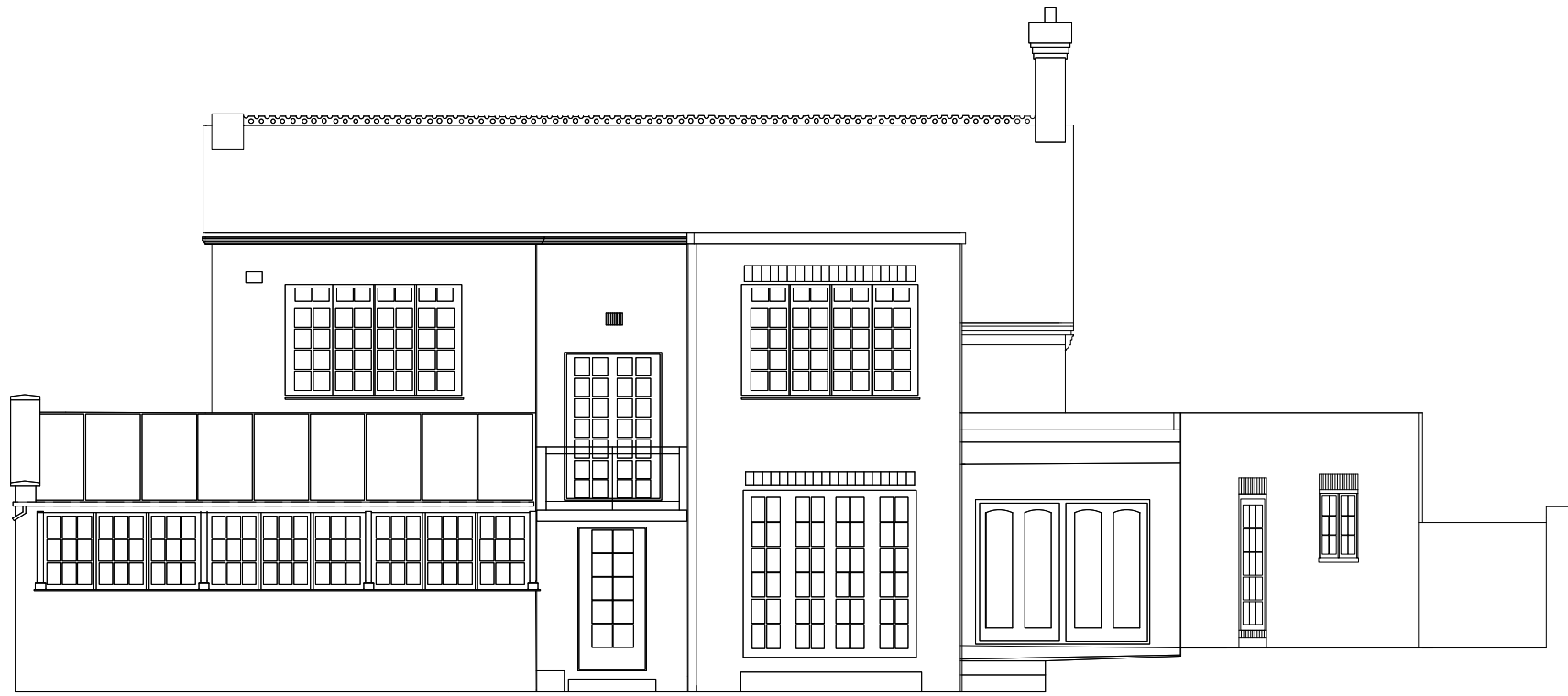
1 Existing Rear Elevation Scale: 1:100