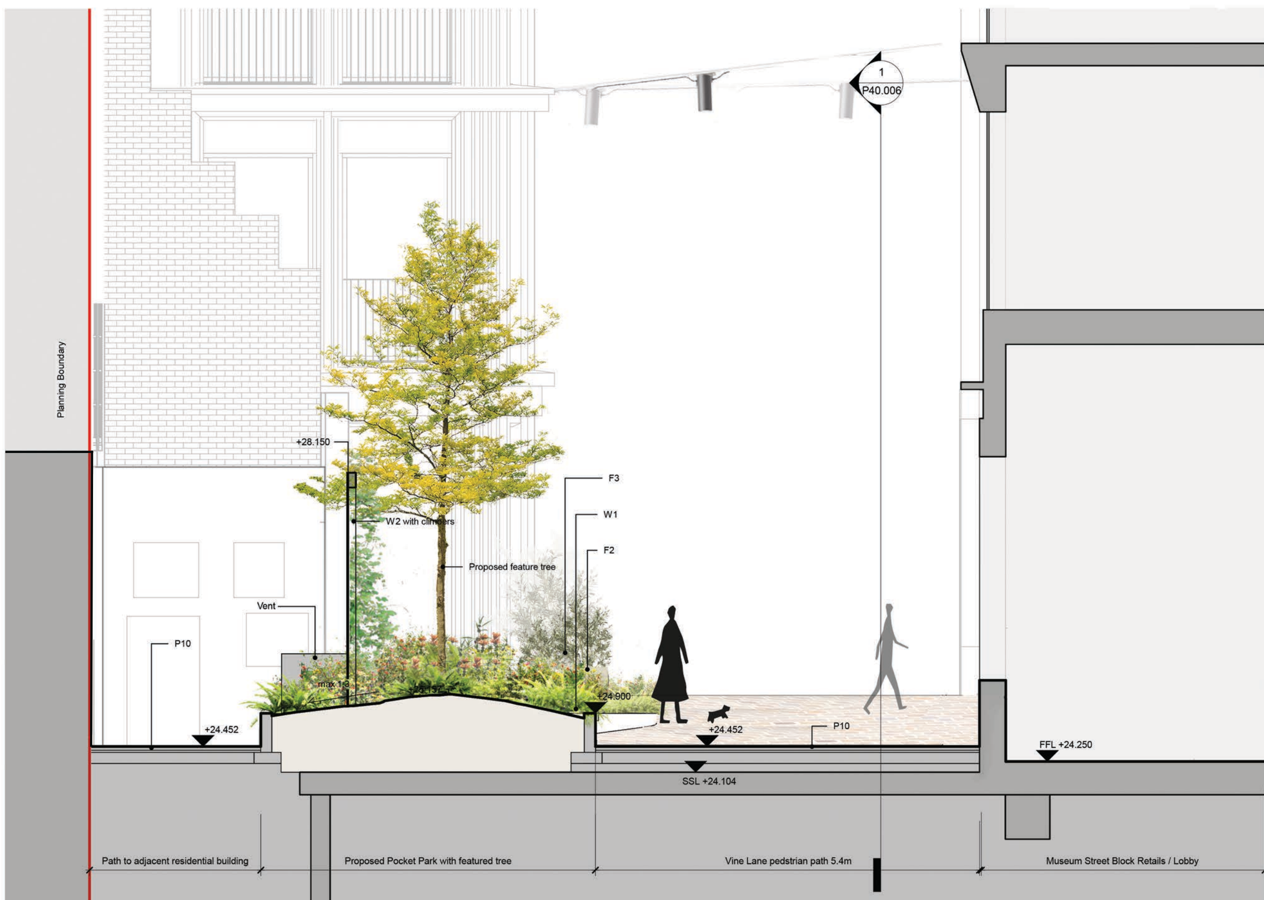
Public Realm - Proposed Site Section HH