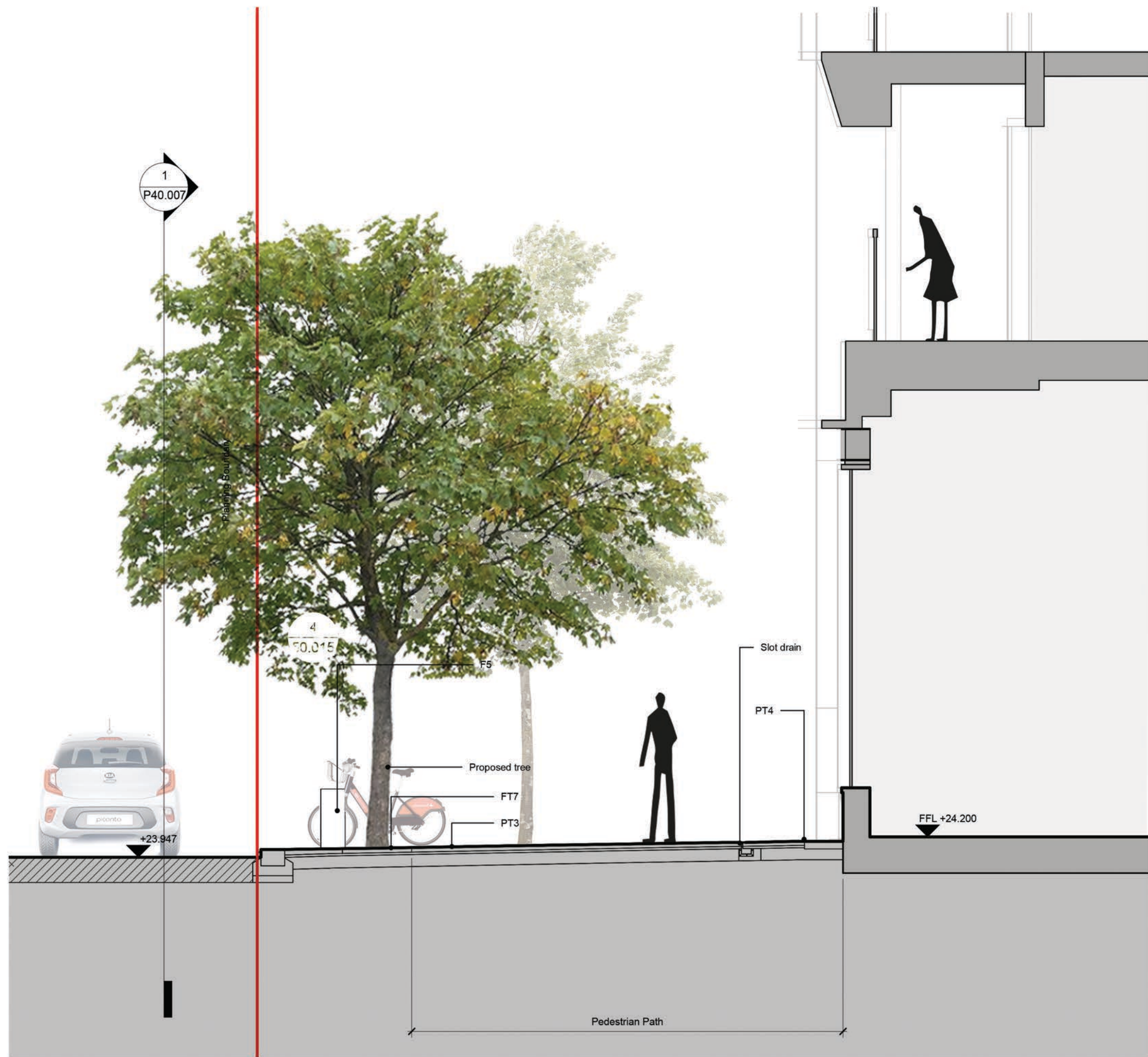
Public Realm - Proposed Site Section GG