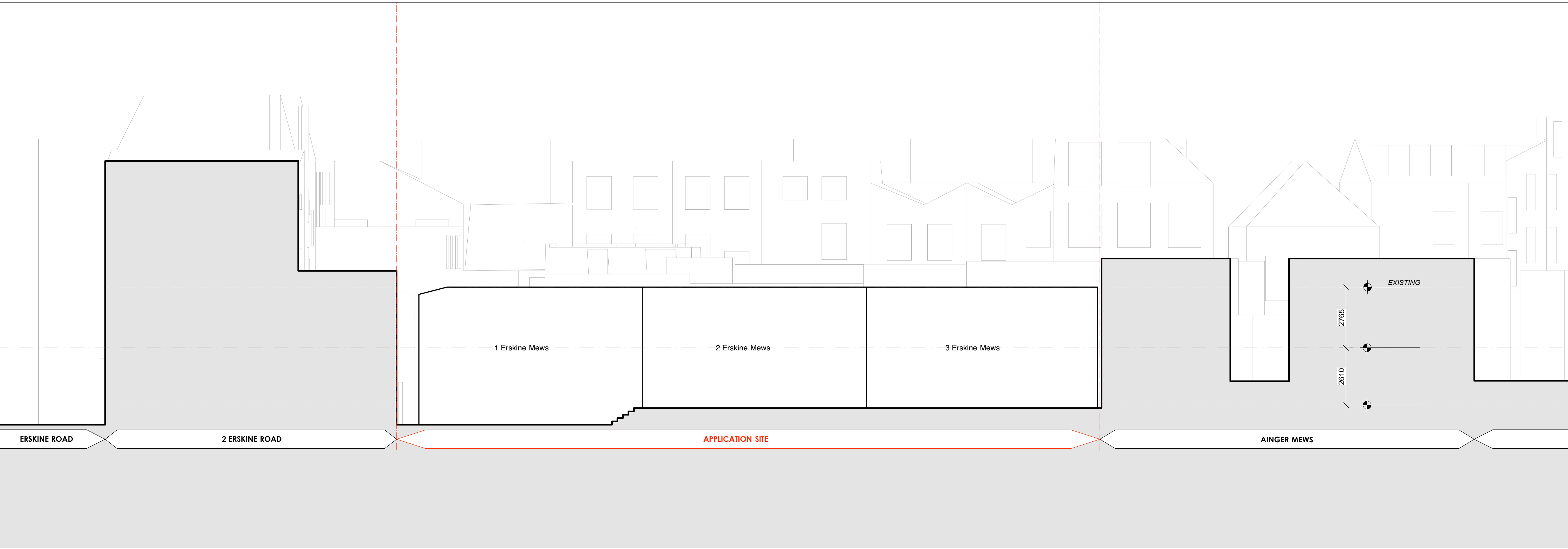
01 Existing Mews Elevation West EE.03 1:100 @ A1 | 1:200 @ A3