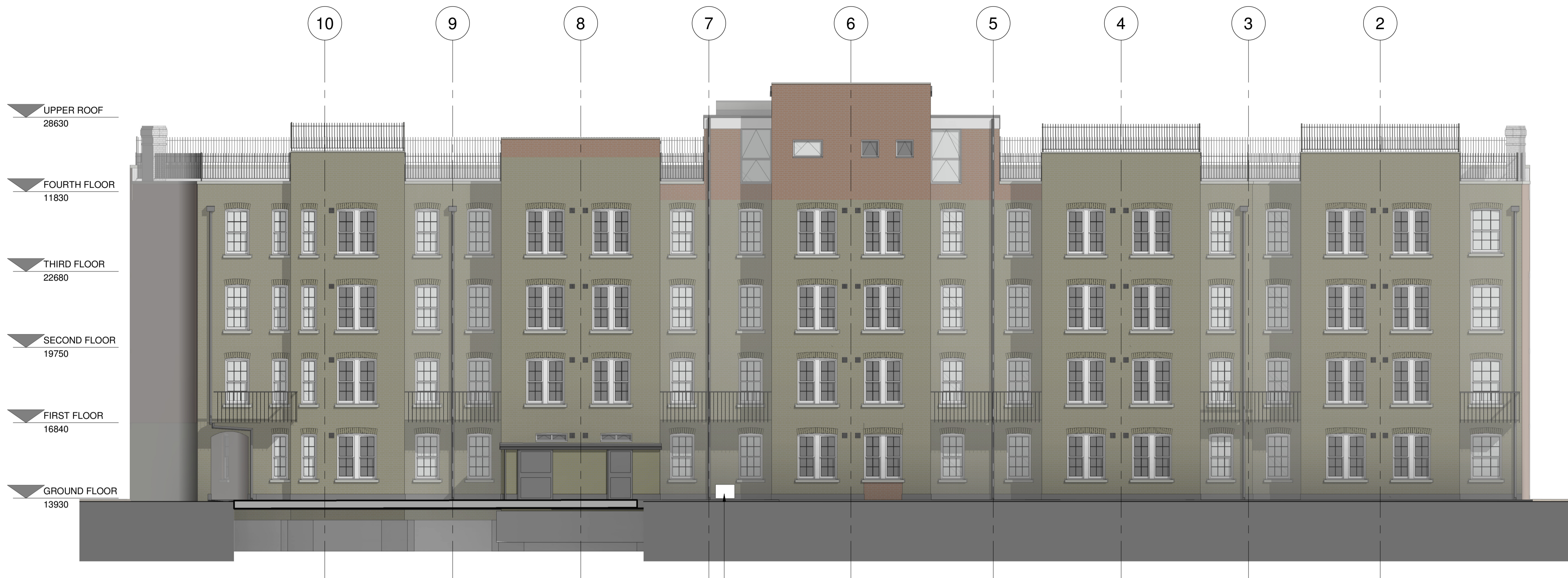
1 1 EXISTING - WEST ELEVATION 07141 07130 1 : 100