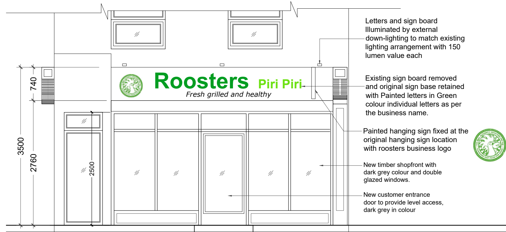
02 - PROPOSED ELEVATION SCALE 1:50