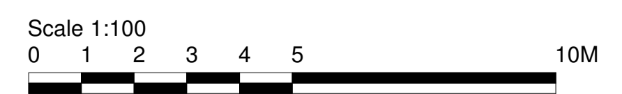
1 DEMOLITION LAYOUT - SECOND FLOOR PLAN 07162 01110 1 : 100

H:\2021\06\01\Documents\SAH-AUK-ZZ-02-DR-A-07162.dwg