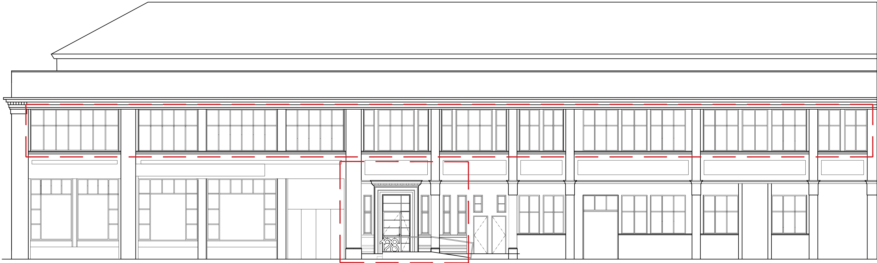
Existing Elevation B 1:100