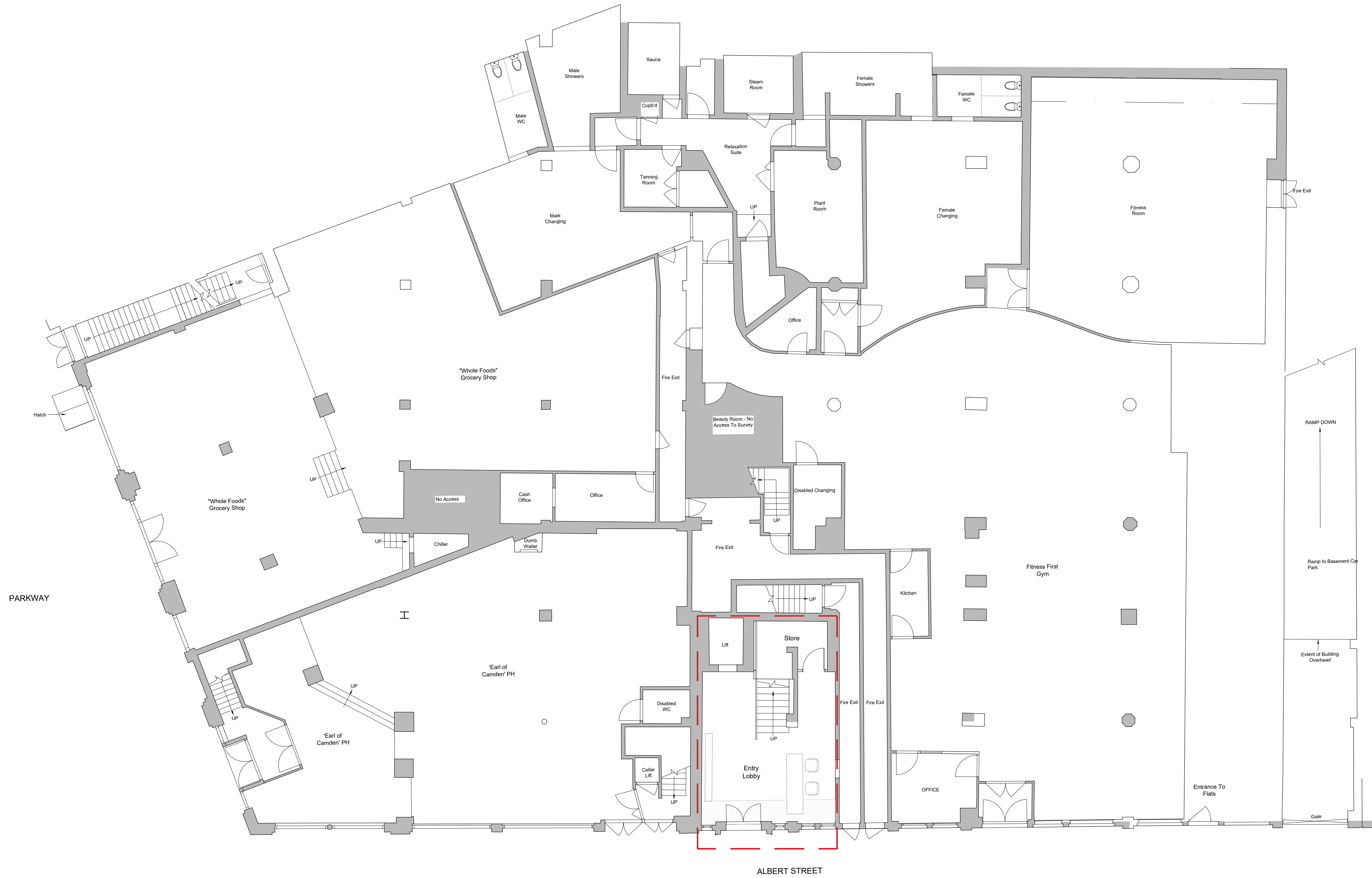
1 Proposed Ground Floor Plan 1:100