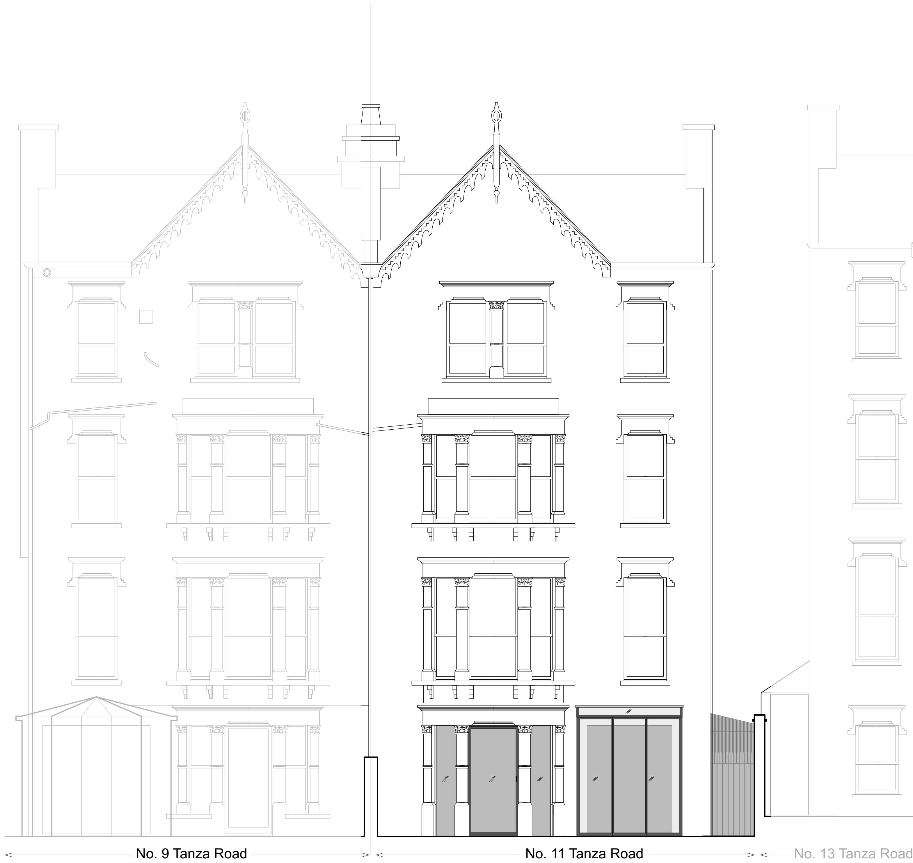
1 Proposed Rear Elevation Scale: 1/100