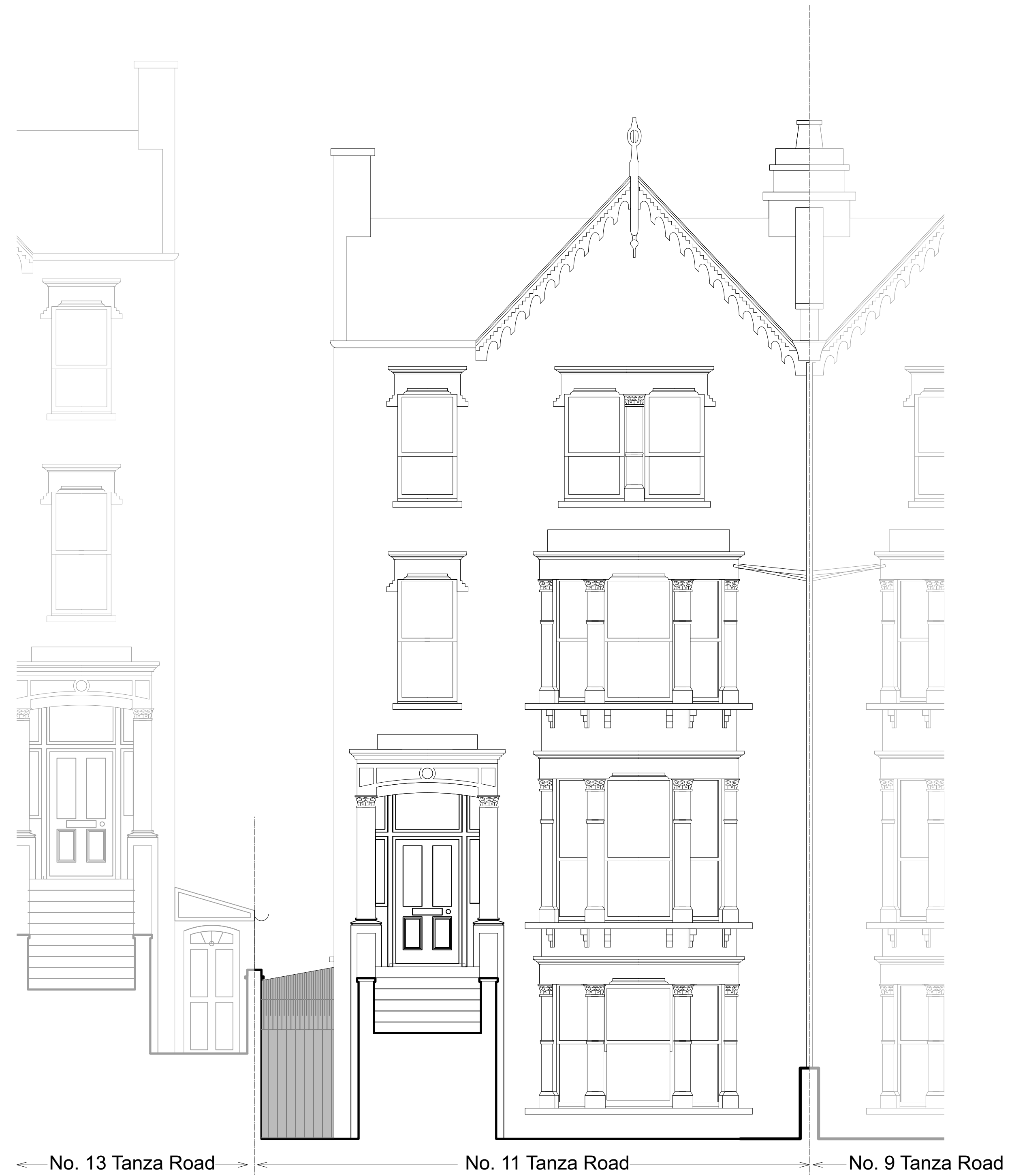
2 Proposed Front Elevation Scale: 1/100