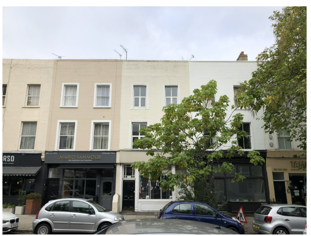
D4 001 Front View