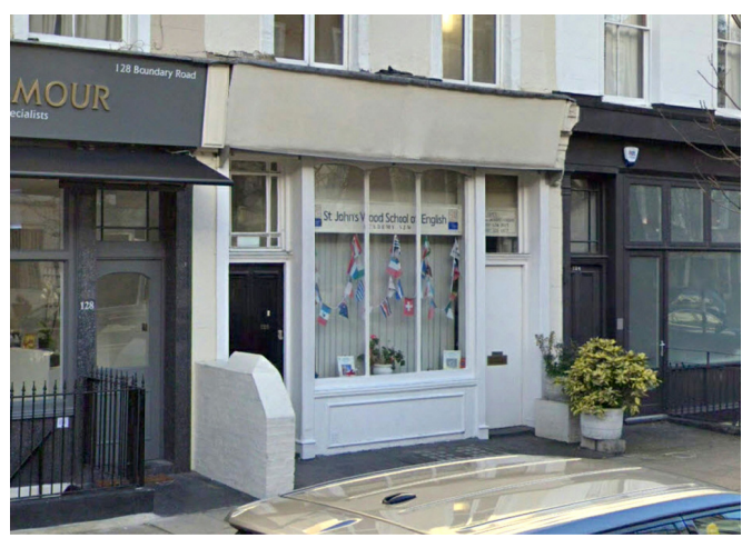
D3 001 Front View