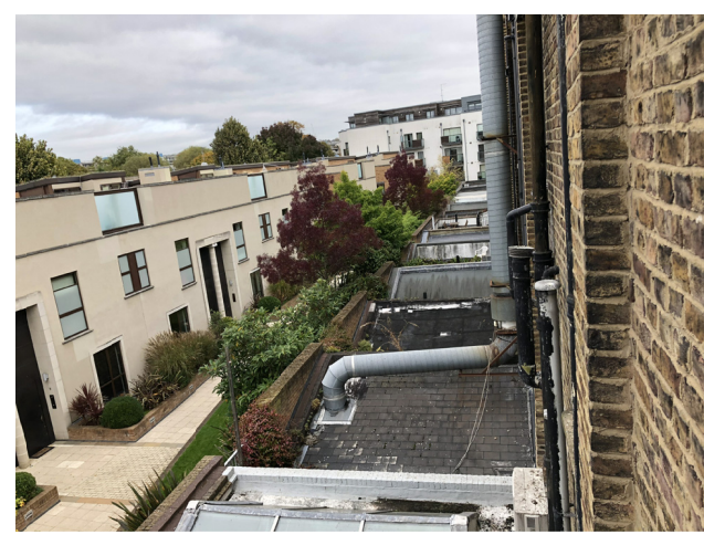
D5 001 Rear View out looking north east