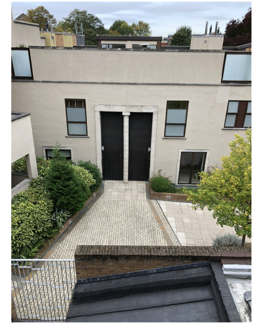
D6 001 Rear View out looking north west