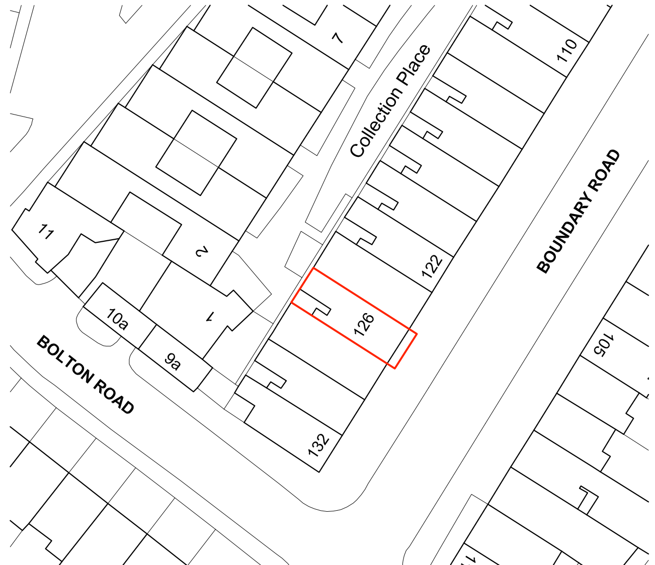
D2 001 BLOCK PLAN