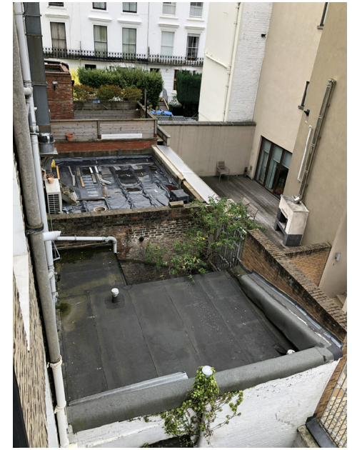
D7 001 Rear View out looking south west