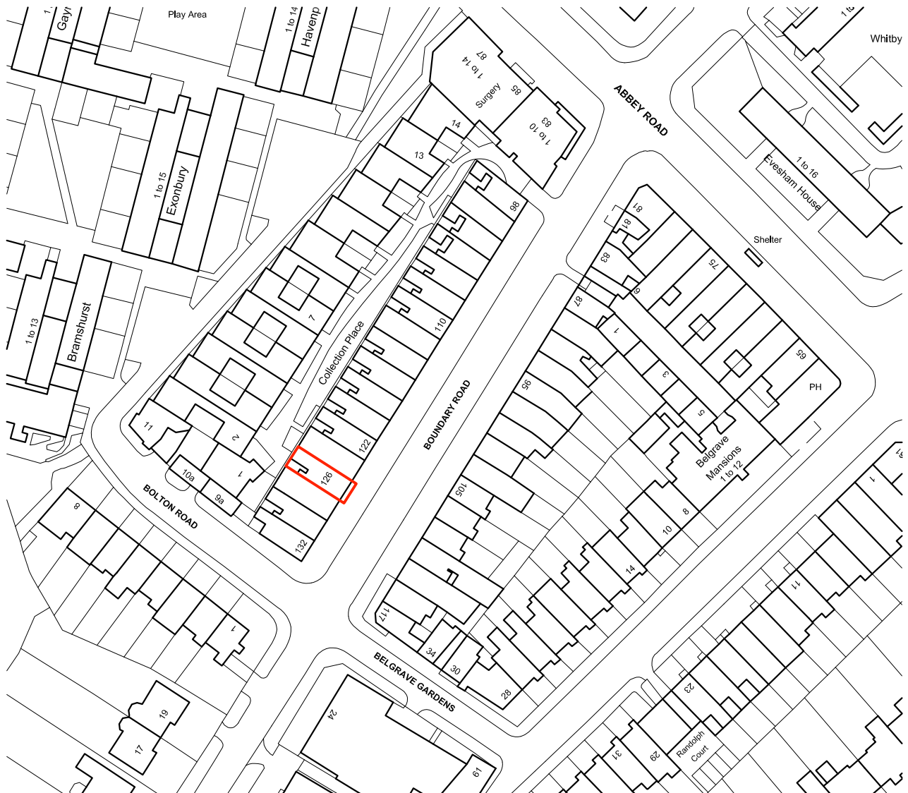
D1 001 LOCATION PLAN