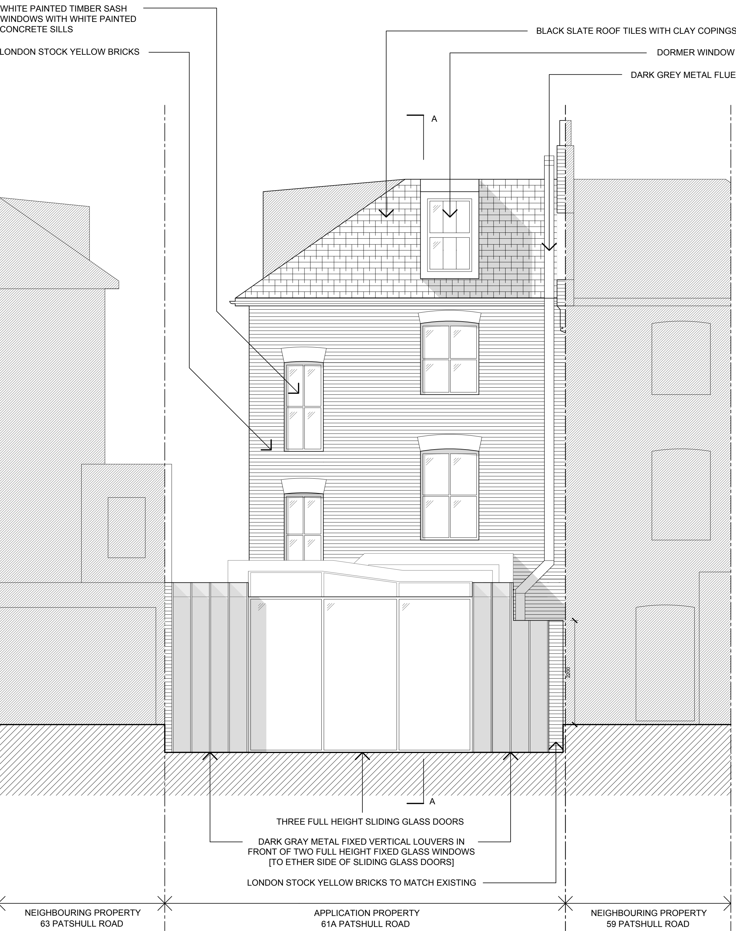
PROPOSED REAR ELEVATION [NORTH FACING]