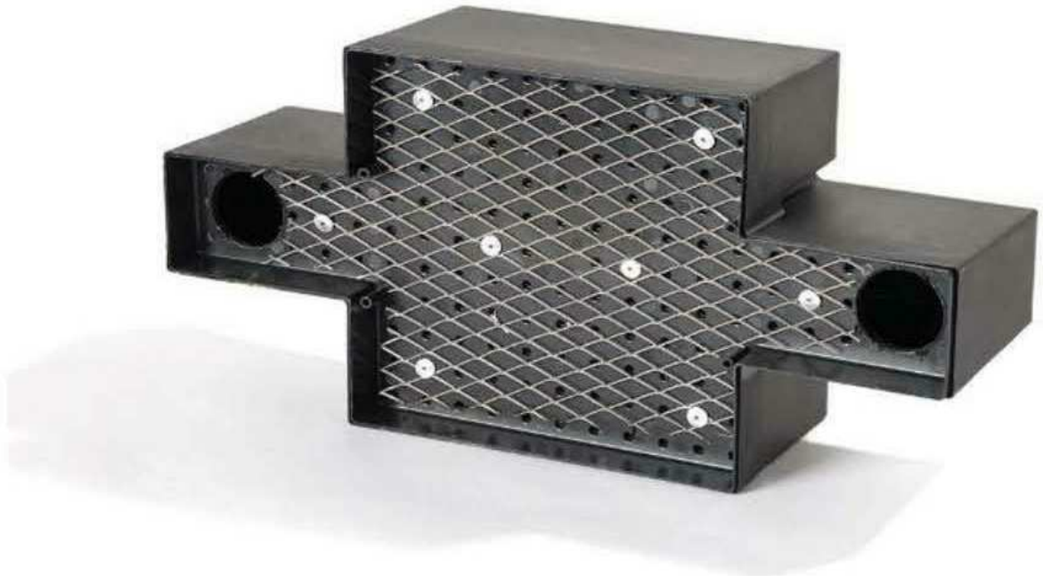
Sparrow Terrace Box with stainless steel mesh fronted larve for render, stonework etc.

The Sparrow Terrace Box is suitable for most buildings in brick (stretcher bond, Flemish bond), render, weather boarding, stone and flint. Boxes for render and stone are supplied with a stainless steel mesh ready for finishing on site.