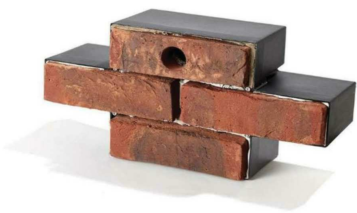
Standard Bird Box fitted with brick slips in stretcher bond

This range of boxes has been designed for projects which require bird and bat boxes to be made of non-combustible materials. The main body of the box is made of stainless steel, real brick slips are bonded to the front of the boxes with a non-combustible adhesive. Retaining screws stainless steel. All internal divides and shelves are made with non-combustible material