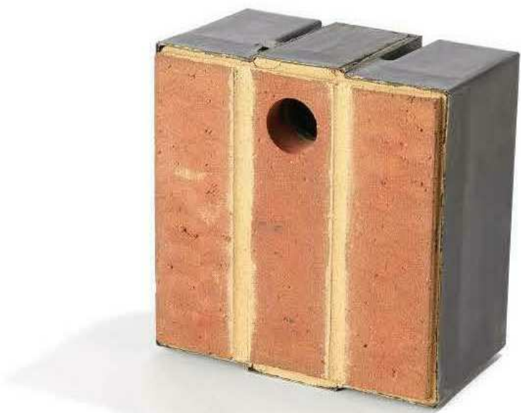
Soldier Bond Box