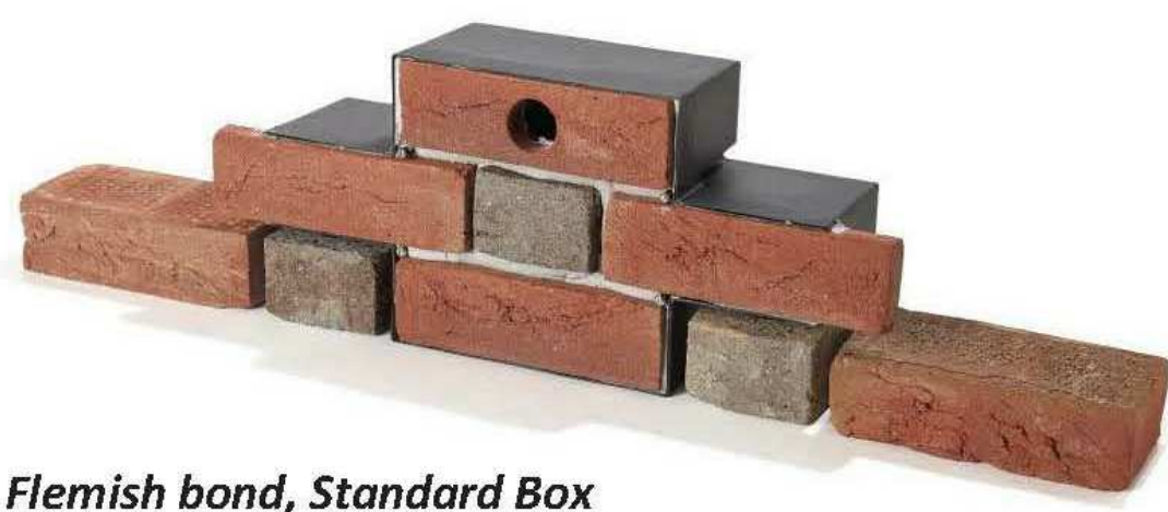
Flemish bond, Standard Box

Note: soldier bond is available; boxes are modified by Bird Brick Houses. Adaptation of the box would reduce length to 225mm.