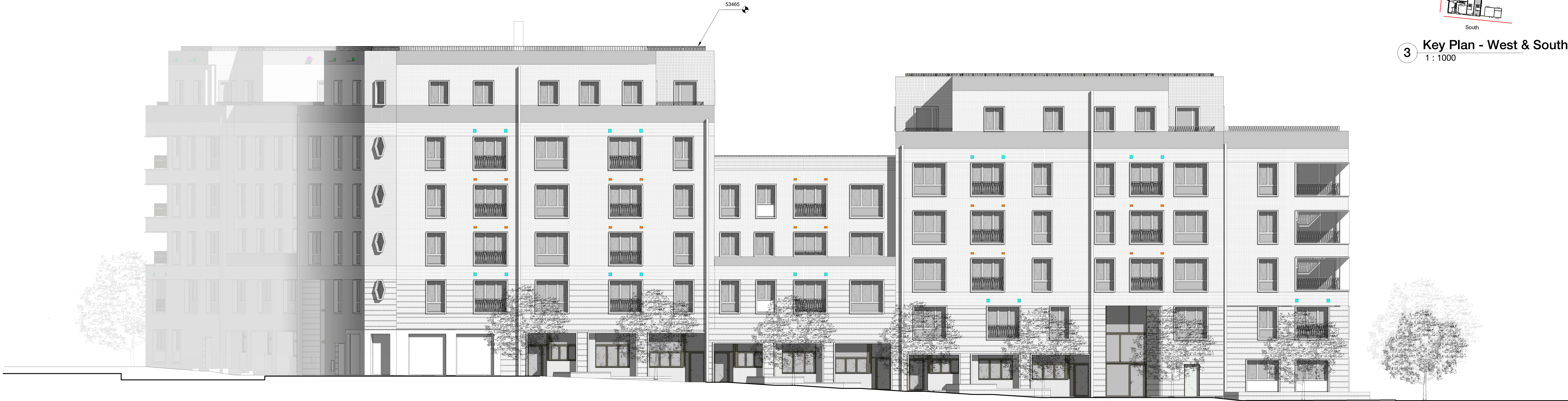
1 West Elevation - Planning 1 : 100