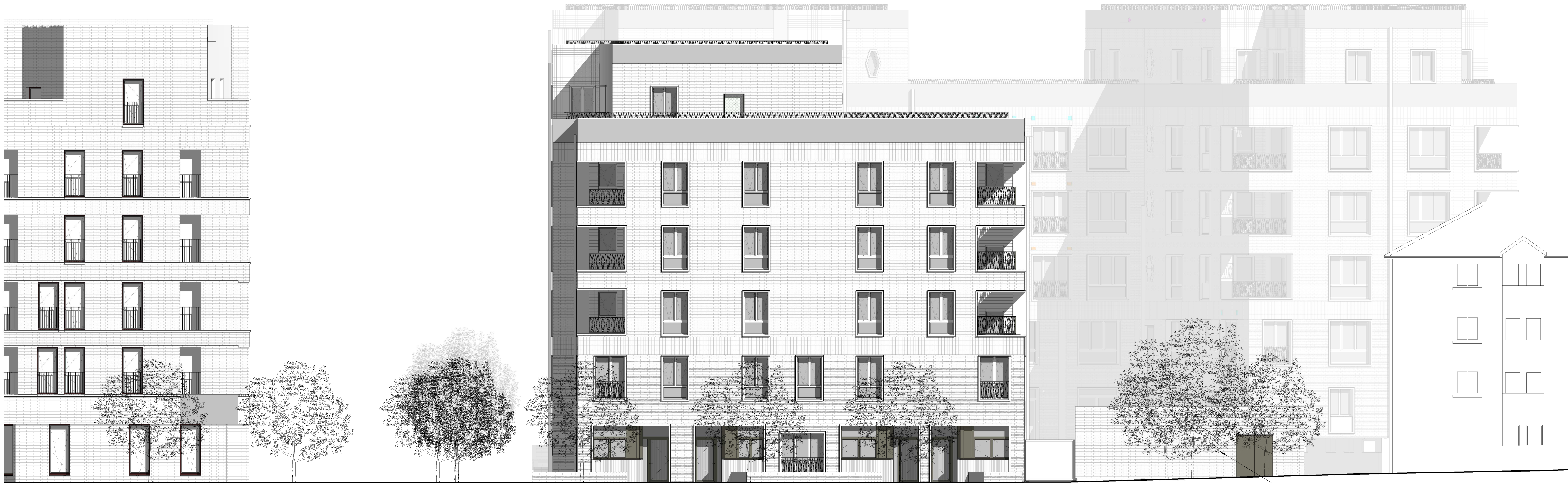
2 South Elevation - Planning 1 : 100