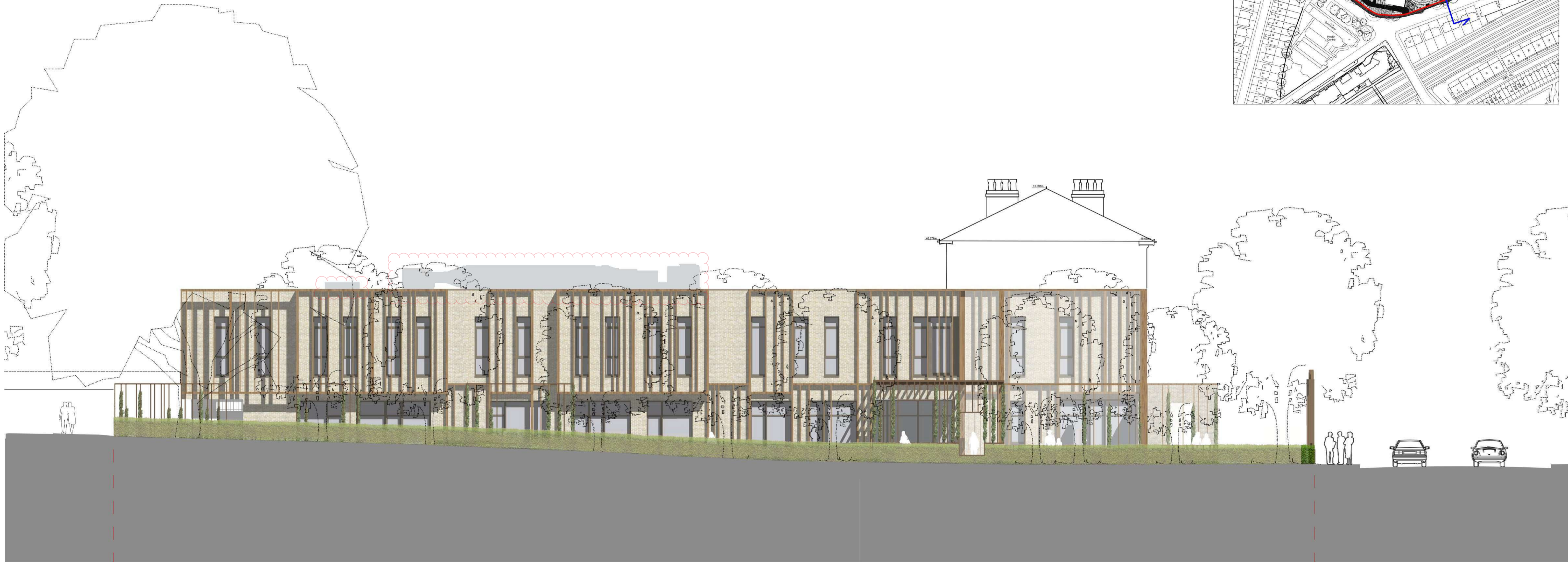
Proposed community and health centre