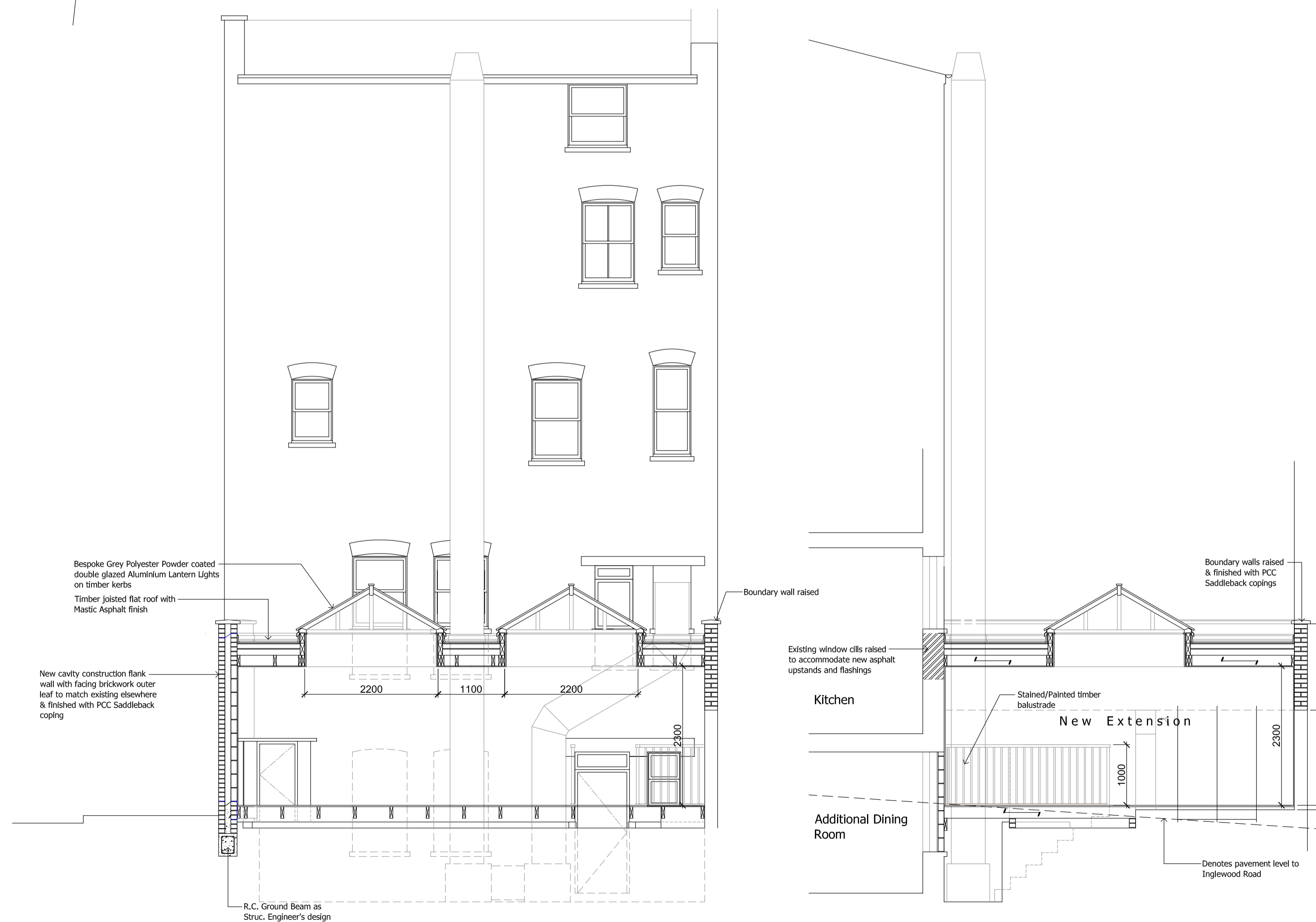
Rear Elevation/Section A-A