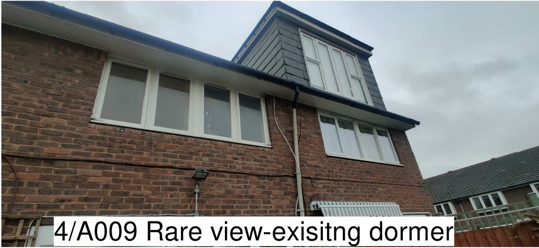
4/A009 Rare view-existing dormer

COPYRIGHT: These drawings are the property of Noel's Design LTD. Do not use or reproduce in whole or in part without written consent of Noel's Design Limited.