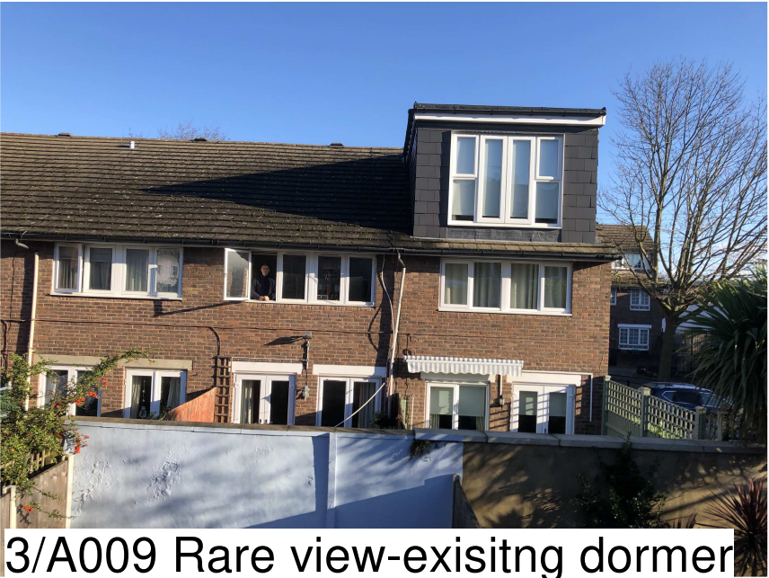
3/A009 Rare view-existing dormer