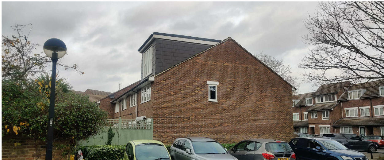
2/A009 Side view showing existing roof dormer for no. 1