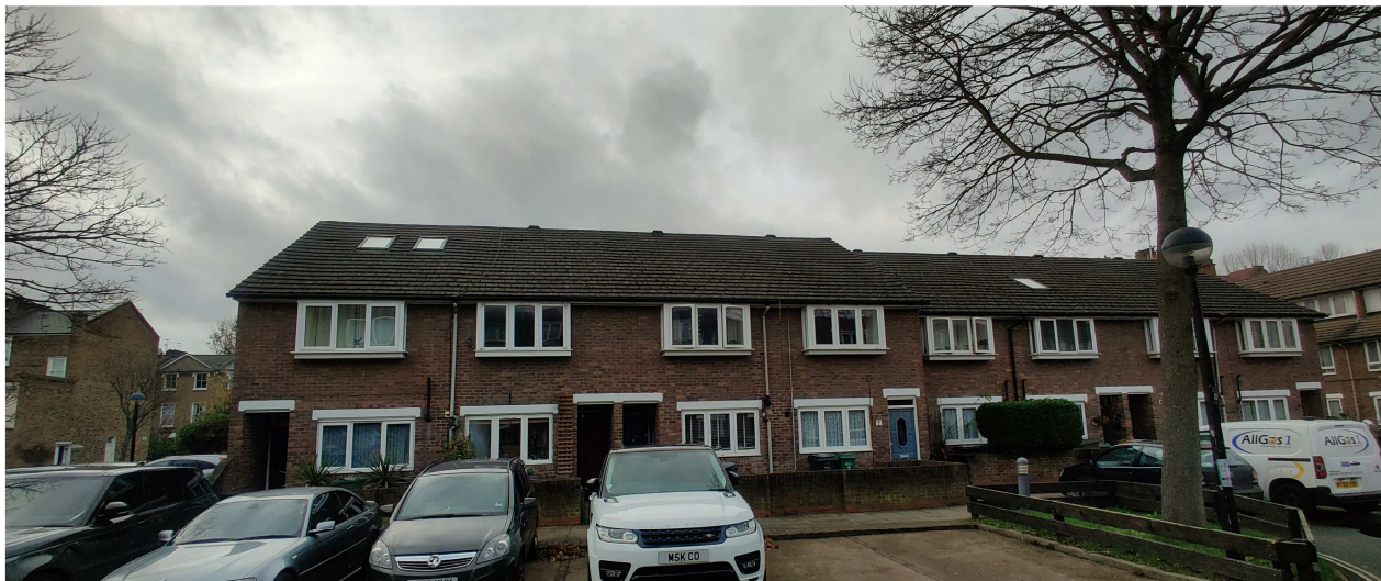
1 / A009 Front view showing existing roof windows on no. 1