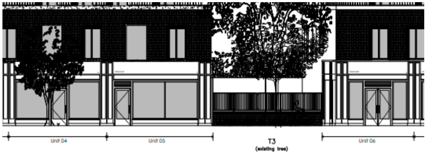
View of the front of the units 4-6

From the benches there is 2.5m distance between the end of the benches and the kerb