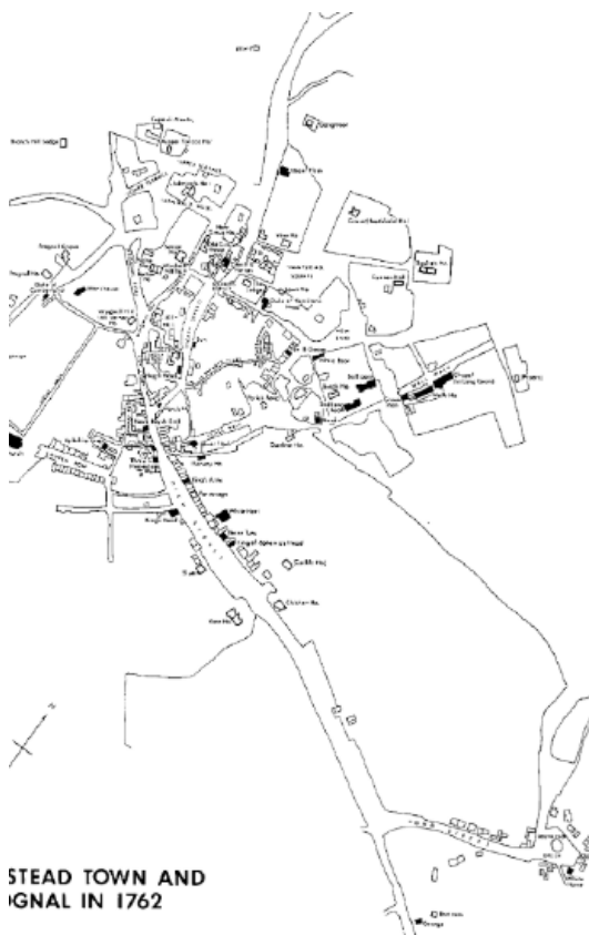
Figure: Hampstead town map - circa 1760s

The largest development of the area took place during the 19th century on land east of the London road, between Pond Street and the built up area around Flask Walk. During this period the third pond to the east of the site was filled to create South End Green. By the First World War nearly all the available land had been built on, leaving room only for infilling or rebuilding.