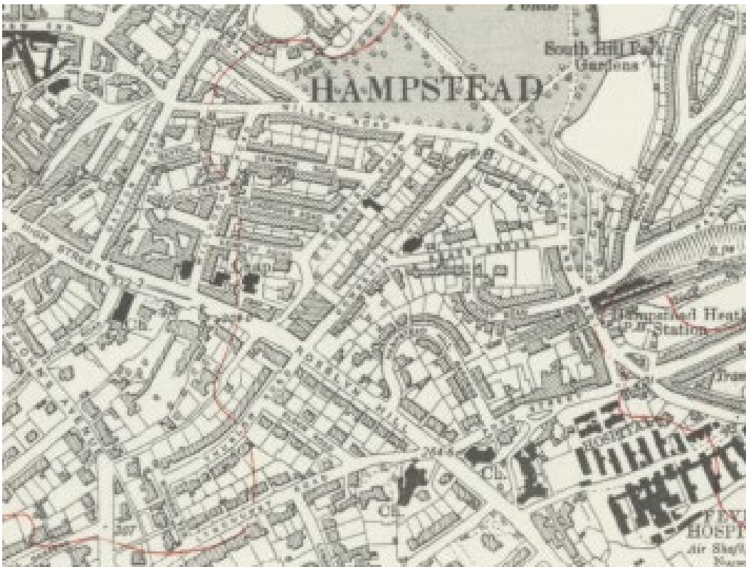
Historic Map – 1930