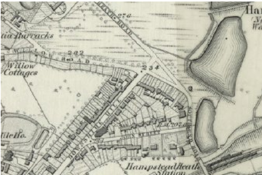
Historic Map – 1873