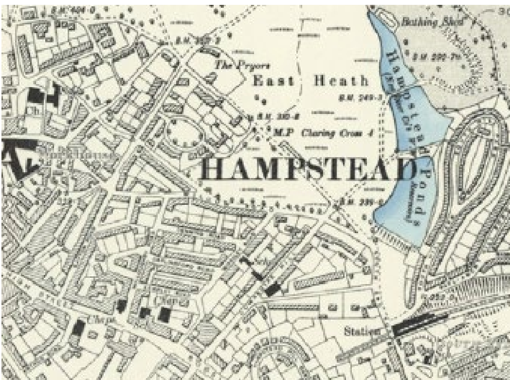
Historic Map – 1899